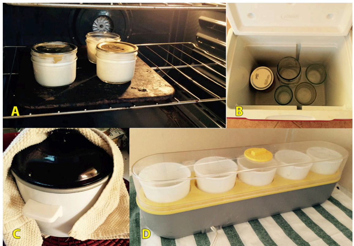
Figure 3. Yogurt incubation methods: A) Oven method. B) Insulated cooler. C) Crockpot. D) Commercial yogurt machine.