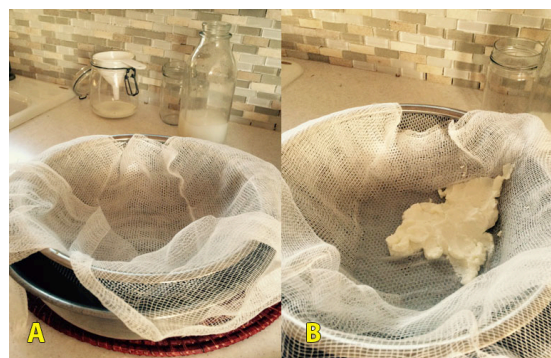
Figure 4. Steps for making yogurt cheese. A) Line a strainer with cheesecloth. B) The whey will separate from the yogurt, producing a cheese-like texture.