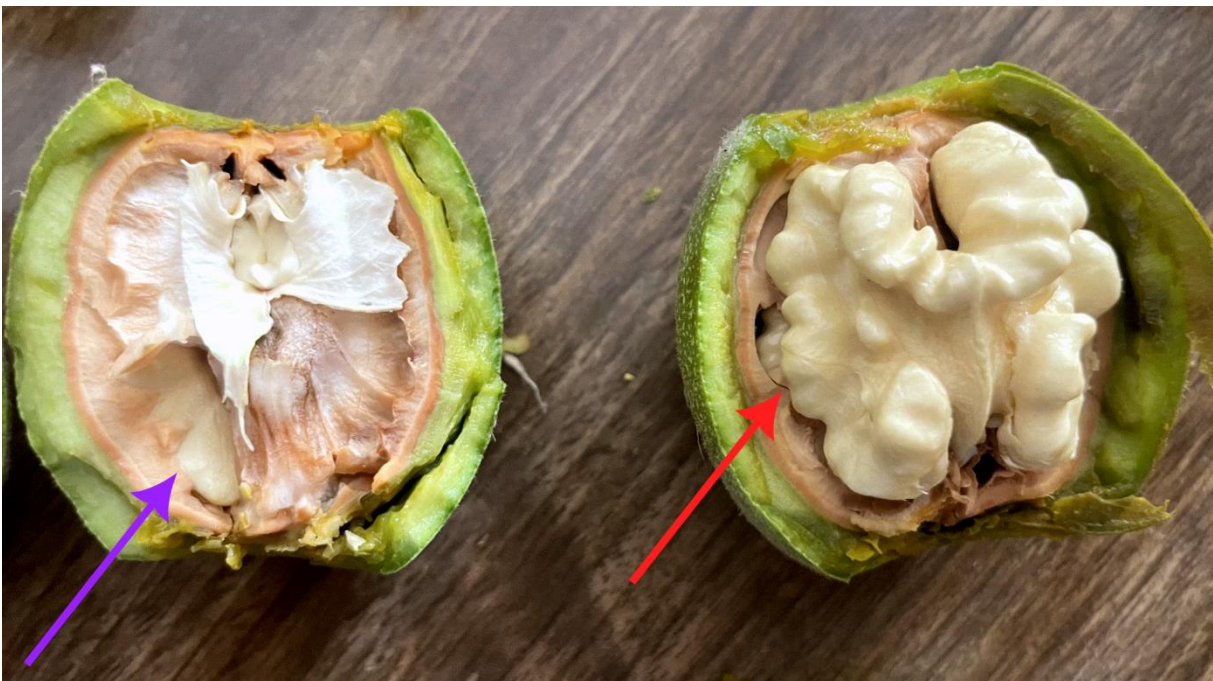
Purple arrow indicating where kernel still attached to packing tissue on immature nut, left; red arrow indicating the kernel detached from the packing tissue close to maturity, right.