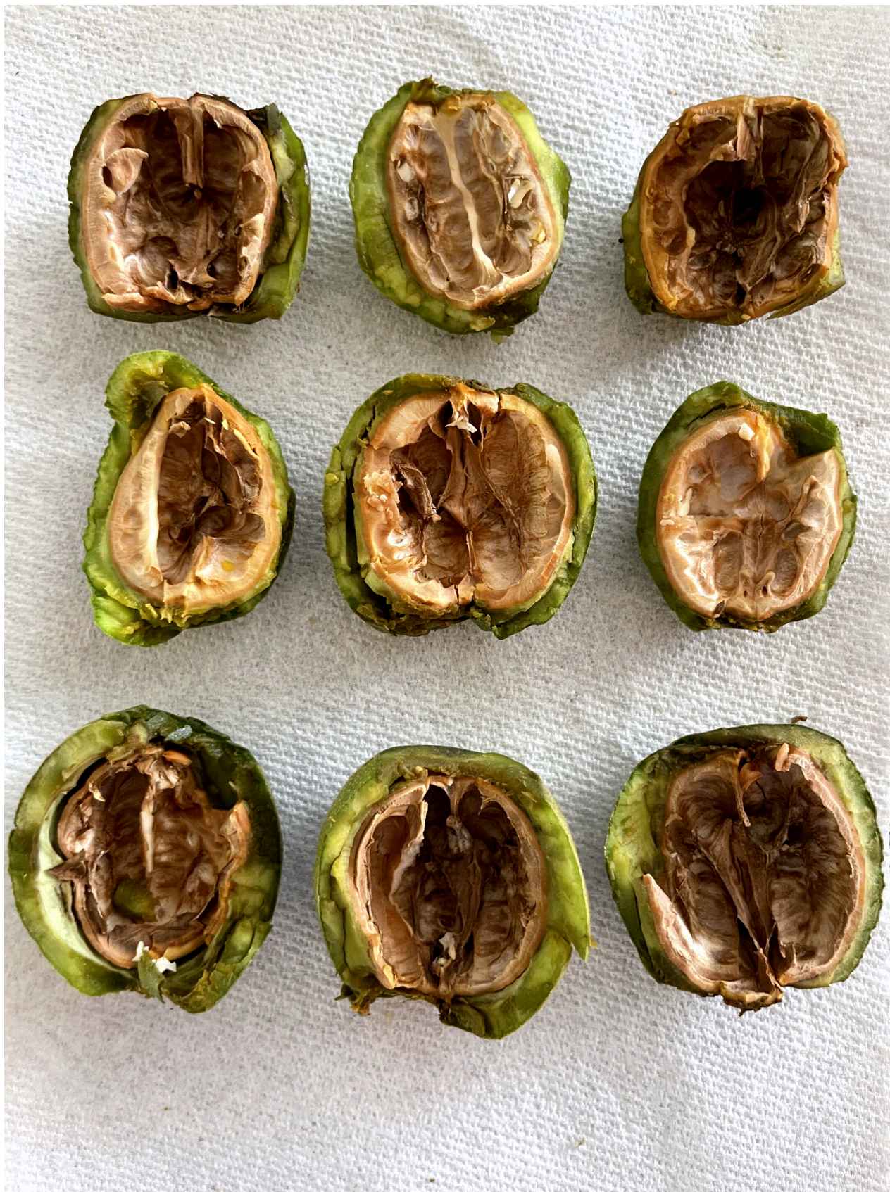
More examples of packing tissue brown.