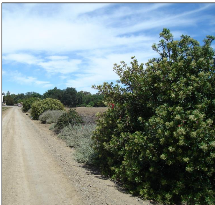
Figure 2. Example of an established native hedgerow along a field border