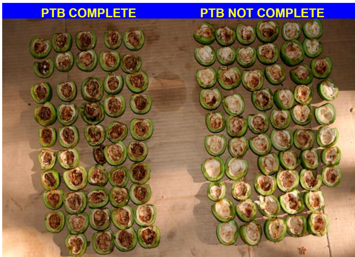
Examples of mature nuts at packing tissue brown (PTB), left, and immature nuts, right.

The point at which walnut kernels are mature, lightest in color, and of highest value is reached when packing tissue between kernel halves has just turned brown, commonly referred to as "packing tissue brown" or PTB. Climate greatly influences this – there is less time between PTB and the time when hulls have separated from the shell in cooler, coastal areas than there is in the hotter and drier valley regions.