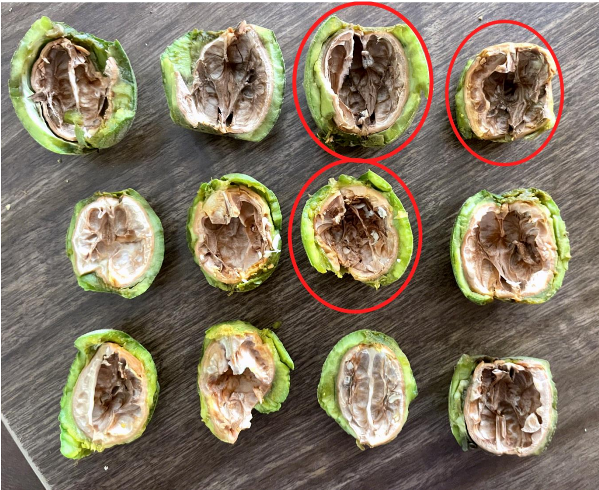
Examples of mature nuts at packing tissue brown (PTB), circled, and immature nuts.