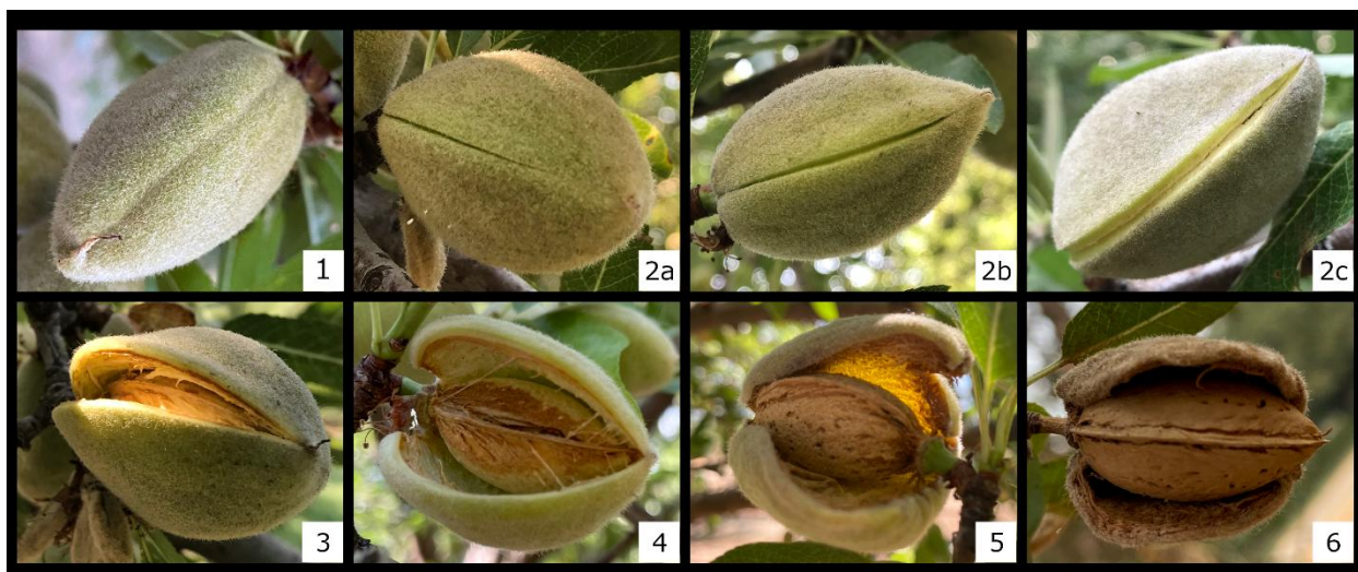
Figure 1. Almond hull split stages

Whether you did RDI or not, provide full irrigation between 90% split and your irrigation cut off ahead of harvest. This imposed water stress ahead of shaking to help reduce barking can also be accomplished by shortening irrigation set length to achieve -15 to -18 bars water stress. After shaking irrigate as soon as possible. If wetting nuts is a concern, a single dripline can be a great investment in microsprinkler and solid set irrigation orchards to avoid unwanted consequences from severe water stress while hulls are drying on the orchard floor.