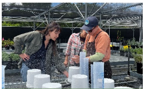
Nursery Irrigation Efficiency Workshop

CFHL in Santa Barbara partnered with Santa Maria Recreation and Parks Department (SMRP) to enhance youth physical activity opportunities during summer break. SMRP Staff received training in the Be Physically Active 2Day (BEPA 2.0) curriculum, featuring flexible activities appropriate for various age groups and settings. This hands-on training equipped 22 staff with skills to enhance classroom management and build confidence in leading physical activities for youth. By implementing BEPA 2.0 in their summer programs, staff are empowering youth to build lifelong physical activity habits, supporting of healthy youth and communities . With the passage of H.R. 1 on July 4th, federal funding for the CFHL program will end on September 30, 2025.