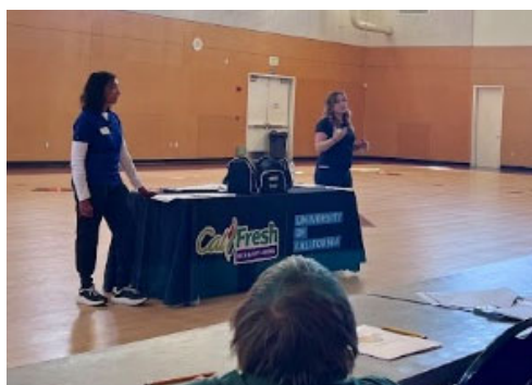
CFHL staff leading a physical activity training