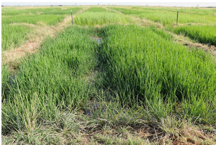
Fig. 2. Rice phytotoxicity damage at 50 days after planting in plots treated with Zembu, Bolero, and propanil. Rice recovered by 90 days after planting.