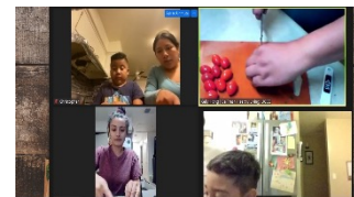
Family Cook Nights