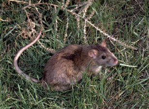
Norway rats favor basements, woodpiles and the ground floor of buildings.

Rats are some of the most troublesome and damaging rodents.