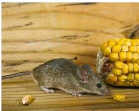
House mouse eating dried corn.

House mice are well adapted to living in close contact with humans and thrive where food and shelter are abundant.