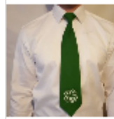
Ties & Collars