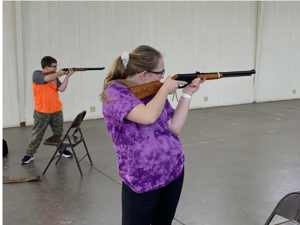
Countywide Shooting Sports-Rifle