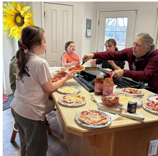
Thompson Peak 4-H Gardening Project Cooking/Foods Project