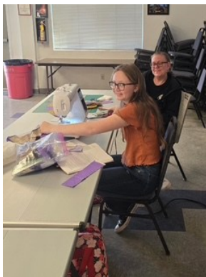
Countywide Quilting Project