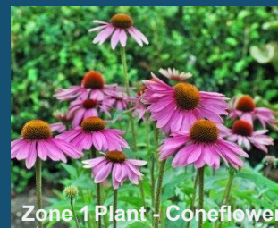
Zone 1 Plant - Coneflower