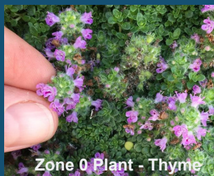
Zone 0 Plant - Thyme

Utilizing native and adapted plants in your garden will require less water, fertilizer, and pesticides and they will ideally thrive in your Tahoe yards and gardens. Natives tend to be slower growing, prefer well drained soils, and overall need less maintenance. Visit www.ucanr.edu/tfg for a list of Tahoe Friendly Plants for each of your defensible space zones.