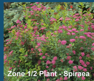
Zone 1/2 Plant - Spiraea