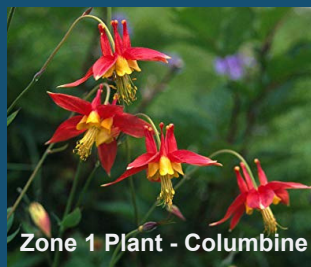
Zone 1 Plant - Columbine