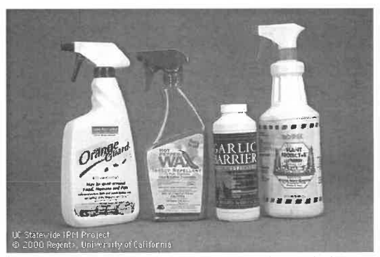
Figure 2. Commercially available pesticides made from botanical extracts.