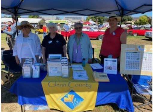
(Picture 1: The Glenn County Master Gardeners at the Hamilton City Car Show on September 14, 2024.)