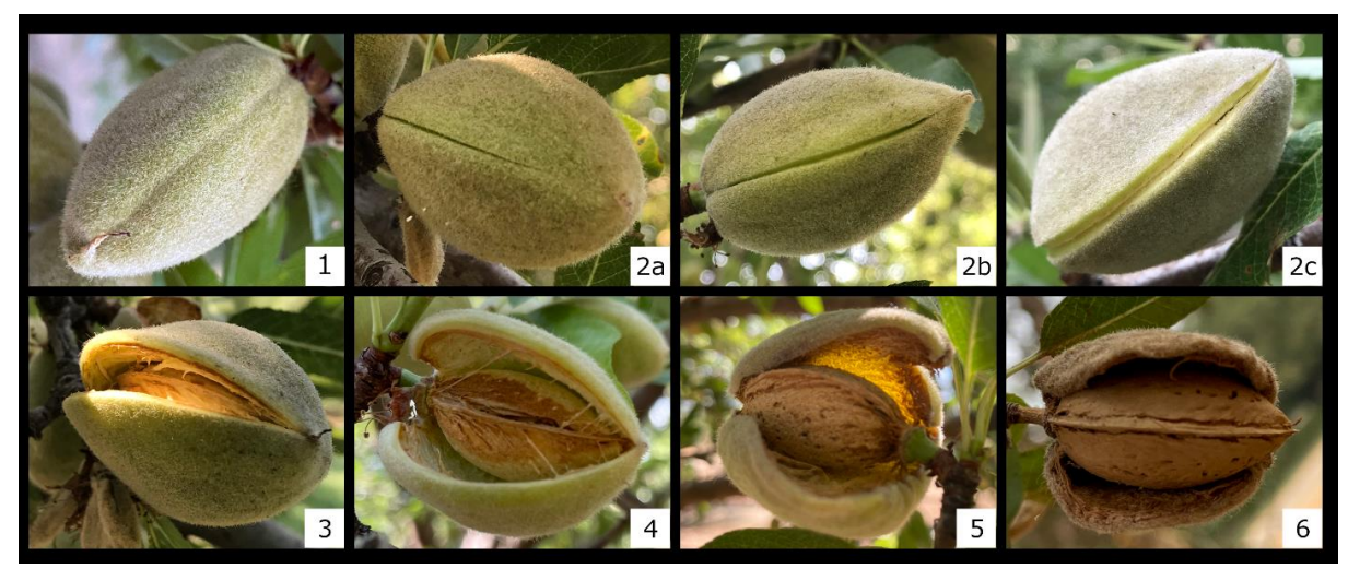
Figure 1. Almond hull split stages

Almonds can be harvested as early as when 100% of the nuts on the tree reach hull split. 100% hull split occurs when the lowest nuts in the lower interior canopy reach stage 2C (Figure 1): there is a deep V at the suture and the nut splits open when hand pressure is applied to opposite ends of the hull. Historically, the recommendation from UC almond experts for the ideal time to shake was as soon as 100% hull split occurred, keeping in mind pest and disease management, nut removal/drying time, and nut quality. However, these considerations vary widely among varieties and locations, so we'd like to address potential challenges that growers should consider when timing harvest, with additional notes on this year's specific challenges.