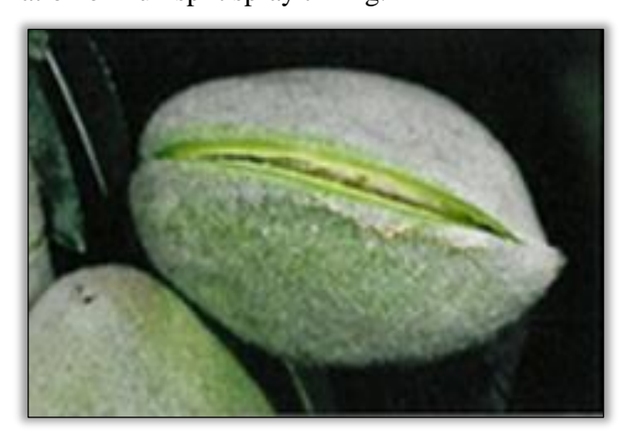
Stage 2C of hull split. This is the critical time for NOW insecticide and Rhizopus hull rot fungicide applications. The orchard is ready for harvest when all nuts are at Stage 2C.

Navel Orangeworm (NOW) & Peach Twig Borer (PTB): Continue monitoring for NOW and PTB to determine when and how to manage these pests in your orchard. Given the high levels of NOW damage we saw last year, and the challenge many growers had in sanitizing orchards over the winter, this is a year to pay special attention to your NOW management. Consider an edge spray when the first sound nuts in the upper canopy of border trees reach hull split Stage 2C (see photo), and a full spray once nuts in the upper canopy of trees within the orchard reach that same stage. Consult with your PCA when making decisions about NOW and PTB management. Switch insecticide chemistries between generations. See the article in this newsletter for more information on hull split spray timing.