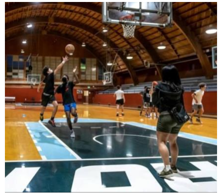
Peace Park basketball program.

Providing free health and wellness classes and installing water bottle filling stations in busy spots across the city.