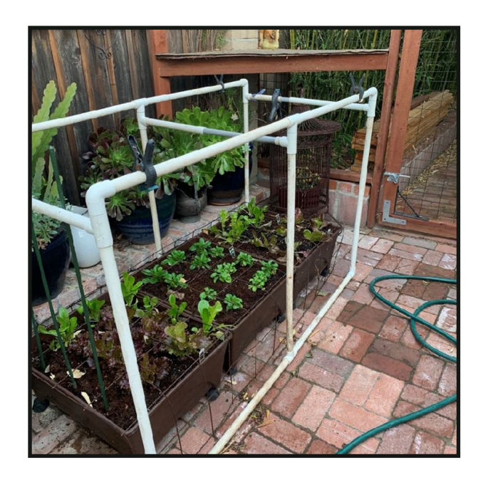
These Photos Display Two Different Styles of Covering Vegetables to Control Environments.