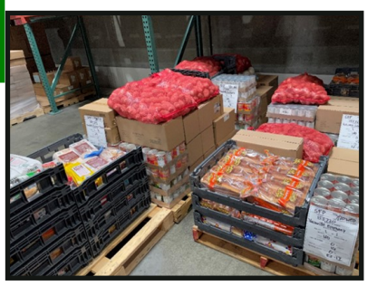
Food Ready to Be Shipped

(Continued From Page 13—The Decline of the Monarch Butterfly)