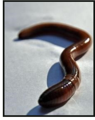
Asian Jumping Worm

These worms do look very similar to the beneficial common earthworm, but you will know the difference by how they aggressively roll around on the ground. They can also jump up to 1 foot in the air!