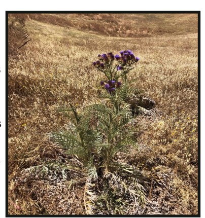
Artichoke Thistle in Late Summer

Controlling these noxious weeds, not to mention eradicating them, is a challenge. Artichoke thistles may live for many years, and can produce thousands of seeds annually. The seeds have long, feathery hairs. They are borne on the wind, and are carried by birds, livestock, and flooding as well. Seeds may survive in the soil for up to five years. Cutting and destroying