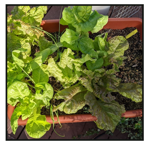
Pretty Leafy Greens