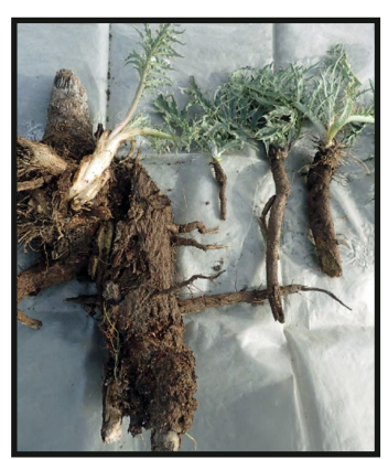
Impressive Taproots

be impossible to hike through, and its spines repel sheep and cattle, which avoid grazing near heavy infestations.