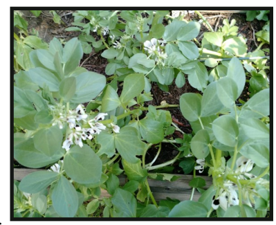
Flowering Fava Beans

than where I live after April. They can be planted in autumn in our Mediterranean climate, but in some gardens the tops may be killed by any frost. The tubers will be fine, but you might want to choose a protected spot.