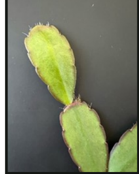
Likely : <u>Schlumbergera gaertneri</u> 'Easter Cactus' (Formerly Hatiora gaertneri, Rhipsalidopsis gaertneri)