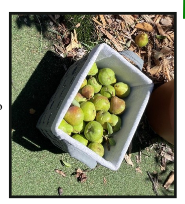
Pears the Author Harvested For the Food Bank

Recently, I donated a box of pears I had grown to the Concord location of the Food Bank of Contra Costa and Solano Counties. They accept donations of food and money. They use both wisely. Over 90% of your money goes to services. It's true they get a lot of extra produce food from commercial growers who donate cosmetic defective vegetables and other surpluses. But, they can always use more fresh food donations.