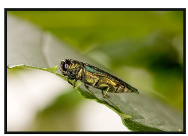
Emerald Ash Borer on a Leaf

The first invasive pest is the Emerald Ash Borer (Agrilus planipennis Fairmaire). These beetles have existed in many areas throughout the United States for quite some time. However, it is only recently that this pest has reached the West Coast and has already been detected in Oregon. They have shiny emerald green