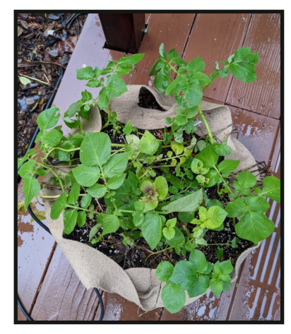
Fingerling Potatoes in Grow Bag