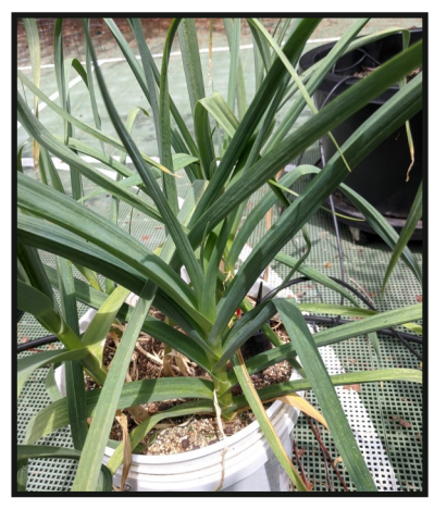
Hardneck Garlic in Containers—Early Winter