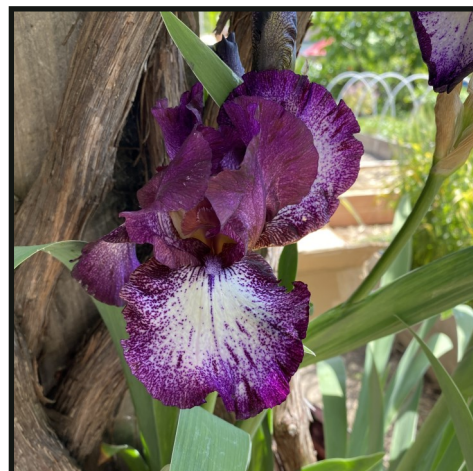
German Bearded Iris