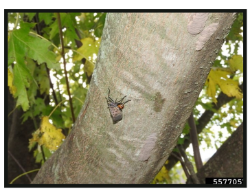
Spotted Lanternfly Next to an Adult Ladvbeetle

According to Melissa Womak, "We need to communicate with California residents about the danger of moving firewood from place to place within the state and especially across the state borders, as firewood can harbor many types of invasive pests like this one." She said that the CDFA Border Inspection Station in Truckee once inspected a truck carrying firewood that was found to be carrying an enormous number of Spotted Lanternfly eggs that were immediately destroyed.