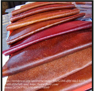
Fruit Leather

Pearl Eddy, U.C. Master Gardener and U.C. Master Food Preserver, Solano County