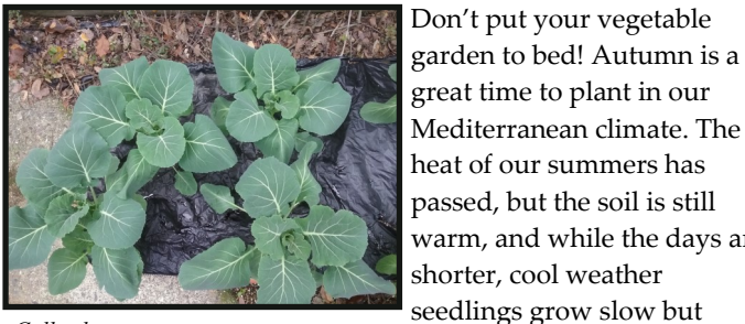
a pleasure to be outside.