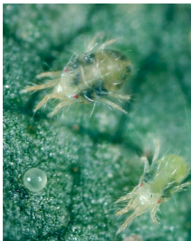
Spider mites; actual size less than 1/50 inch.

Mites are tiny and difficult to see. Although related to insects, mites are arachnids just like spiders and ticks. If leaves are stippled with white dots or have webbing, check the undersides to see if spider mites are present. Sprays of water, insecticidal oils, or soaps can be used for management. Spider mites have many naturally occurring predators that often limit their numbers.