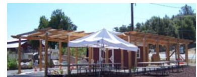
Example of shade area to reduce chance of heat illness.

If a treated victim does not recover from heat illness in a reasonable amount of time, promptly seek medical attention. Plan ahead to know how to summon medical assistance and direct emergency responders to your location or how to transport the heat illness victim to a medical service provider.