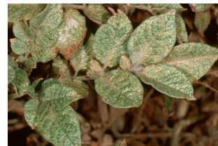
Spider mites cause leaf stippling or spotting and may leave webs when numbers are high, as seen on this potato leaf.