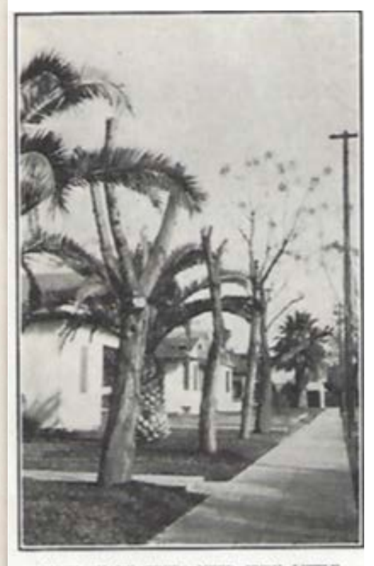
MOST SHADE THEES NEED VERY LITTLE PRUNING AND SUCH BUTCHERY AS THIS SHOULD NEVER HE PRACTICED.