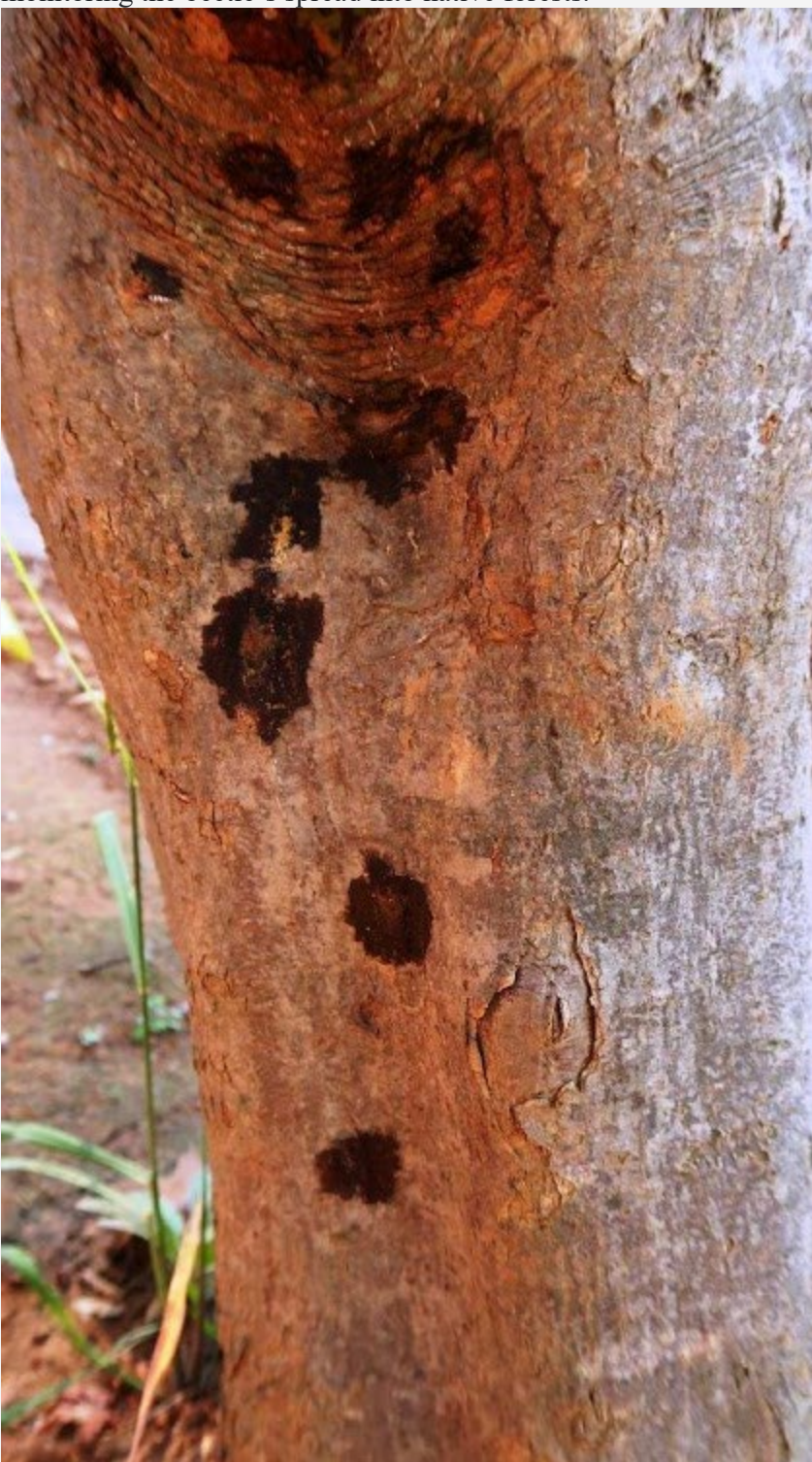
Stained bark is a symptom of shot hole borer infestation.

This includes both exotic and local varieties; about 35 of the 80 are indigenous. Scientists are monitoring the beetle's spread into native forests.