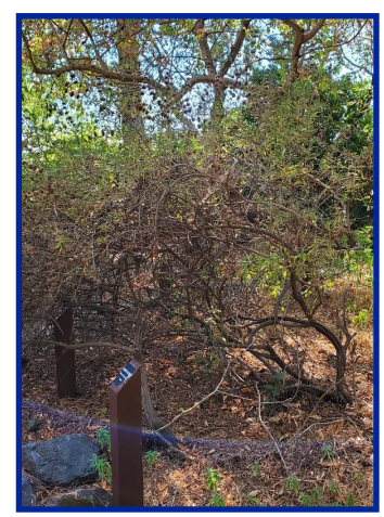
Santa Rosa Island Sage (Salvia Brandegeei) -BEFORE