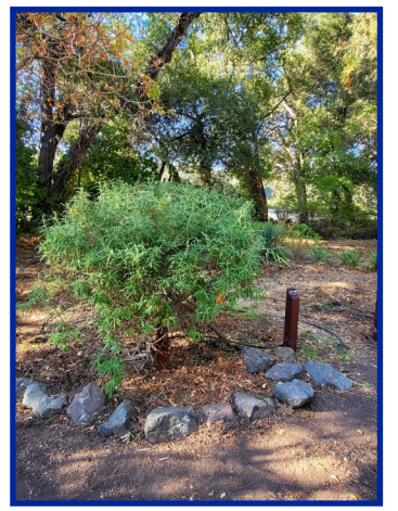
Santa Rosa Island Sage (Salvia Brandegeei) -AFTER