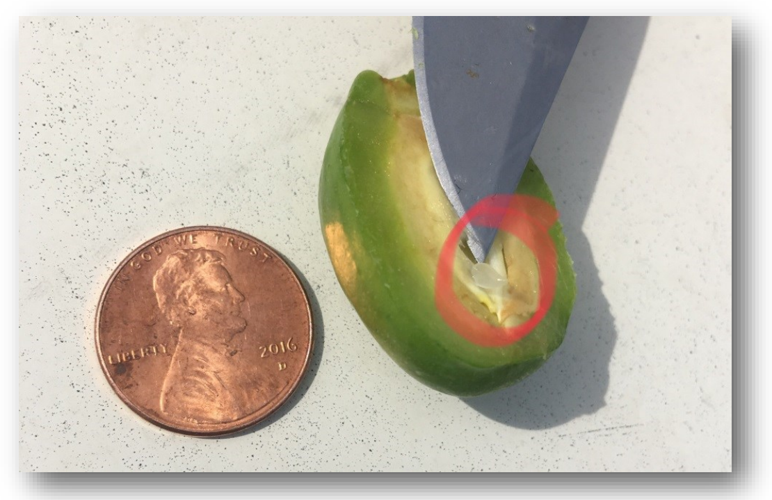
Figure 1. Extraction of the endosperm on a developing prune. When 90% of the fruit cut as in this photo shows endosperm, then the fruit can be shaker thinned if there are too many fruit on the trees.

To find out if thinning is needed, check cropload from 2-3 trees per orchard at or just before reference date, which usually falls between April 20<sup>th</sup> and May 10<sup>th</sup>. Reference date occurs when 80 to 90% of the fruit have a visible endosperm (see Figure 1), which is approximately one week after the pit tip begins to harden. The endosperm, a clear gel-like glob, the beginning of the developing seed, will be found in the seed cavity on the blossom end of the prune (Figure 1) and is solid enough to be removed with a knife point. The warmer the spring, the earlier reference data arrives. Checking crop load this year (2022) will be more challenging given the freeze of April 12.