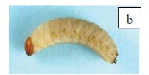
Figure 3. (a) Western pine beetle adult (b) Red turpentine beetle larva

Attacking female beetles lay their eggs along tunnels constructed in the moist inner bark next to the wood. Once the eggs hatch, the larvae burrow away from the parent or egg tunnel. When fully grown, the larvae transform to pupae and then adults. Each beetle species has a characteristic tunneling pattern, which often can be used for identification. Emerging adults bore out through the bark, leaving it riddled with a 'shot hole' appearance. Depending on the species, bark beetles produce one to several generations a year. The last generation typically overwinters under the bark, emerging the following spring. Adult bark beetles are cylindrical, brown, dark reddish brown or black and typically about the size of a grain of rice (Figure 3a). The larvae are grub-like, white, legless, and 'C'-shaped with a distinct light brown head (Figure 3b).