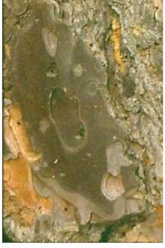
Figure 6. Outer bark partially removed by woodpeckers