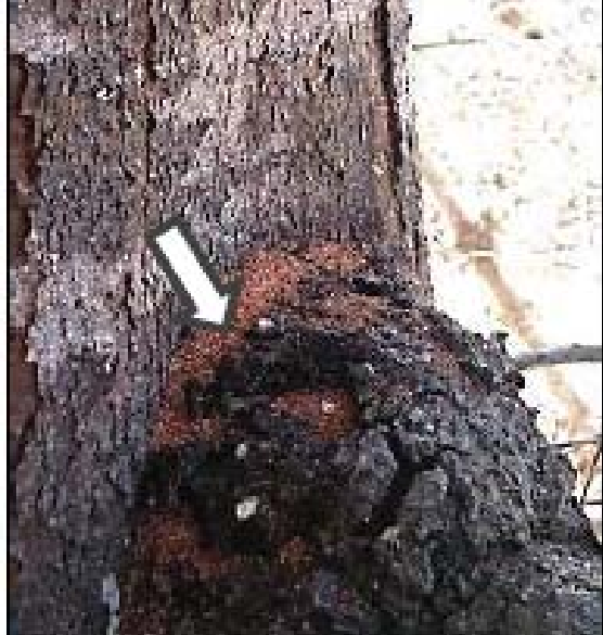
Figure 2. Boring dust accumulation on spider web (left) and branch (right).