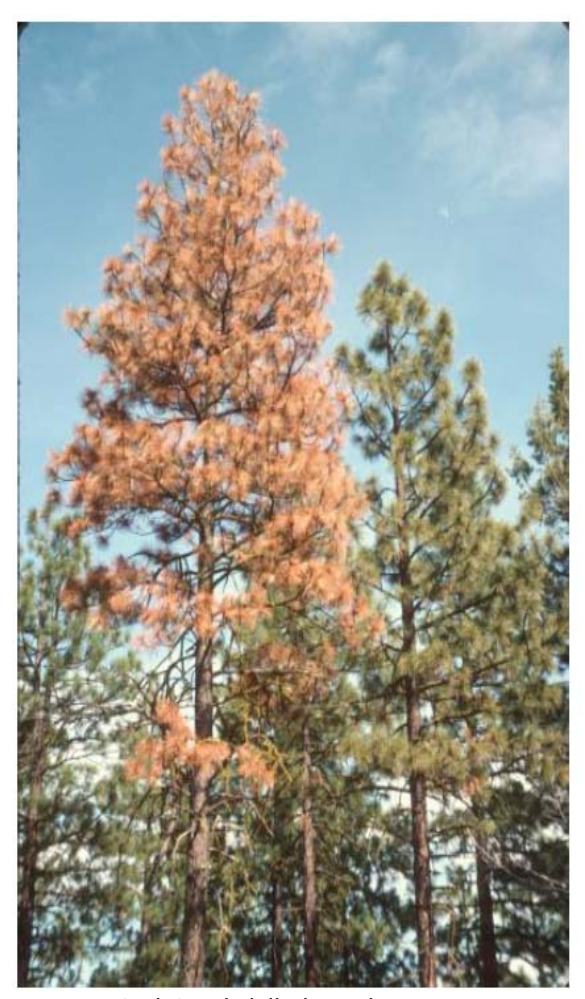
Figure 4. Bark Beetle killed ponderosa pine.