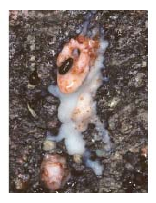
Figure 1. Mountain pine beetle and pitch tube on lodgepole pine

Pitch tubes, pitch streaming down the trunk and boring dust are signs of bark beetle attack on conifers. On hardwoods, the signs are bleeding, frothy or wet spots on the bark, or powdery boring dust.