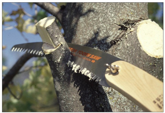
Figure 10: Pruning infested branches with invasive shot hole borer and surface sterilizing pruning saws.

<u>Pruning</u> – Pruning of infested branches is another viable option. This technique can be used and is most effective for trees that only have infested branches. Be sure that the only part of the tree that is infested is that branch and follow proper pruning guidelines. Once the infested branch is removed it must be chipped and either properly disposed of or solarized. The pruning saw must also be surface sterilized to prevent the spread of the Fusarium pathogen to a healthy tree. Cleaning solutions containing at least 70% ethanol can be used to surface sterilize pruning saws (see Figures 10a & 10b).