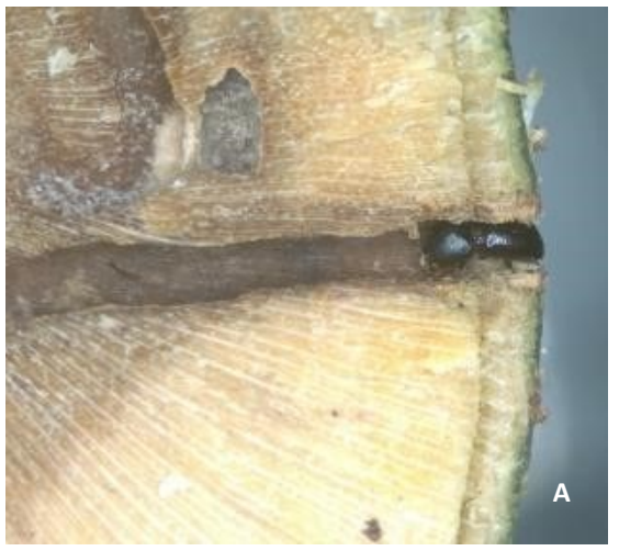
Figure 6: Invasive shot hole borer and fungi growing in gallery walls. Photo by Akif Eskalen, UC Davis

Figure 5: Invasive shot hole borer galleries Photo by Akif Eskalen, UC Davis