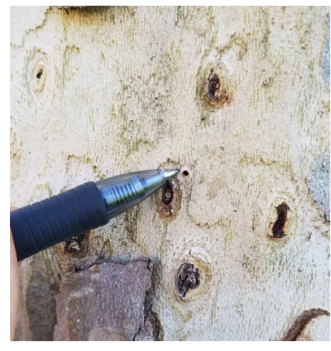
Figure 3: Invasive shot hole borer entrance hole.

Staining symptoms: The presence of staining or discoloration of the bark associated with a ballpoint-pen tip sized entrance hole is a good indicator of ISHB infestation. Each host tree has a unique visible response to the damage caused by the insect-disease complex. Some hosts respond to the infestation by producing long streams of sap oozing down the trunk, while other hosts produce distinct staining around the entry holes. Sugary exudate, gumming and frass are other symptoms that may be noticeable even before ISHB entry holes are detected (see Figures 4a-4e). If the staining is caused by ISHB it will not be associated with cavities along the stem or human made mechanical wounds. When the outer bark is removed from the stained areas, the entrance hole for the ISHB gallery should still be visible and the gallery should extend down into the wood.