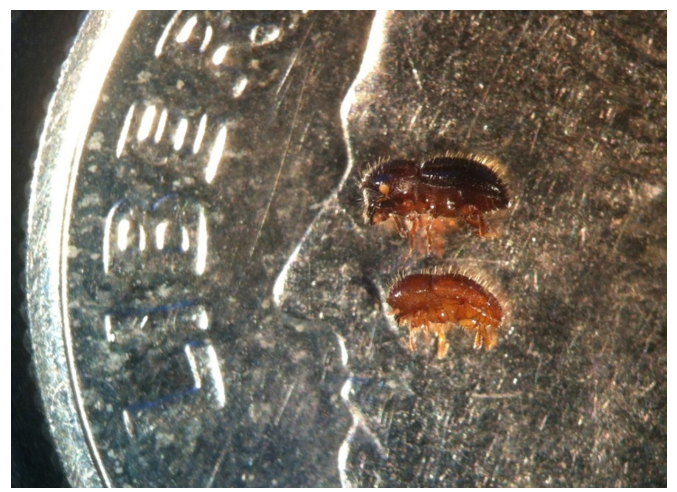
Figure 2: Invasive shot hole borer adults, teneral adults and larvae.

Figure 1: Invasive shot hole borer female (top) and male (bottom) adults.