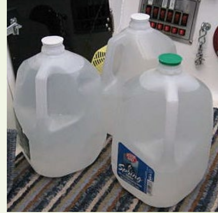
3 gallons of clean water per handler at the start of the workday