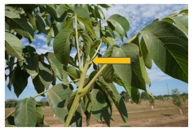
Fig. 4. (Above) Example of a set terminal bud.

For young trees, stop irrigating in September to set the terminal bud (Fig. 4) and harden off the trees, later resume irrigation if needed to avoid tree stress.