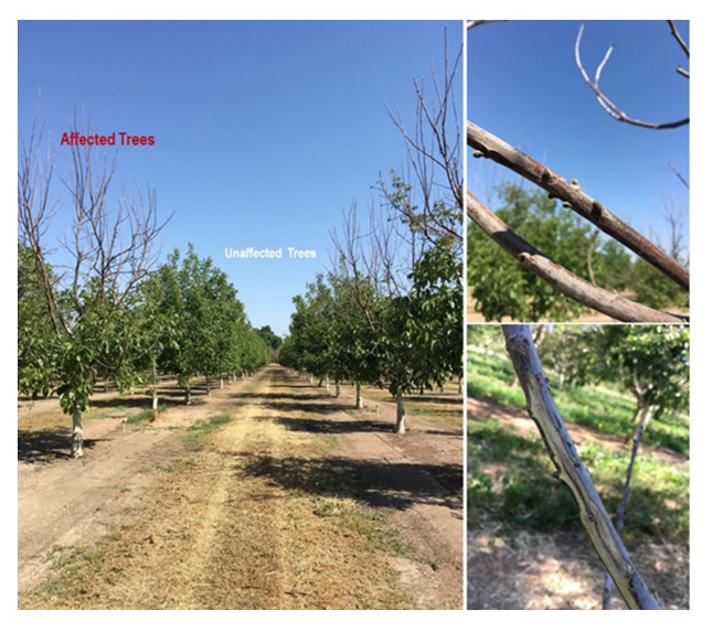
Fig. 3 (Above) Freeze damage in a 9th leaf Solano orchard. Severity of symptoms is variable across and within orchard blocks (damage beneath the bark appears as brown discoloration).

Freeze damage in walnuts is caused by freezing temperatures in the fall. Often times this occurs in young orchards where new growth is still being formed during periods of freezing night temperatures. Over the last two years UCCE Walnut Advisors observed damage in older orchards where material should be dormant. Freeze damage is brown, necrotic tissue which can appear to be related to pathogens, but no signs of fungal infection are present. Please see Fig. 3 for photos associated to freeze damage.