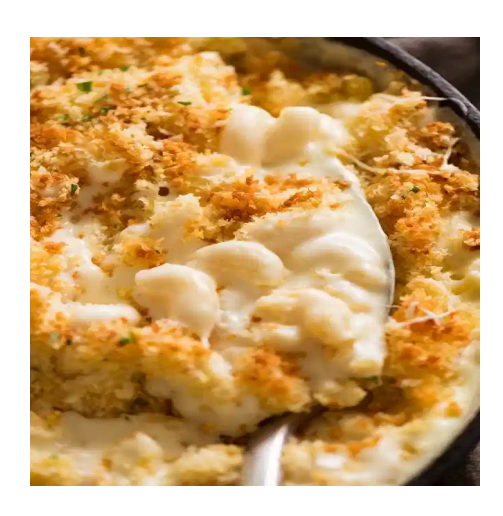
Macaroni 8 oz macaroni (elbow pasta) 1TBSP butter

Topping: <sup>2</sup>/<sub>3</sub> cup panko breadcrumbs 2 TBSP butter <sup>1</sup>/<sub>4</sub> tsp salt