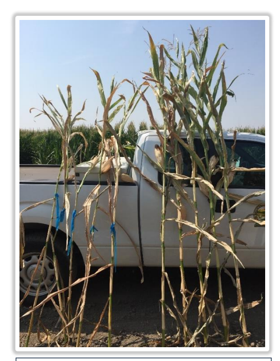
Figure 1. Chronically droughtstressed corn (left) is shorter with thinner stalks and poorly developed ears and tassels.