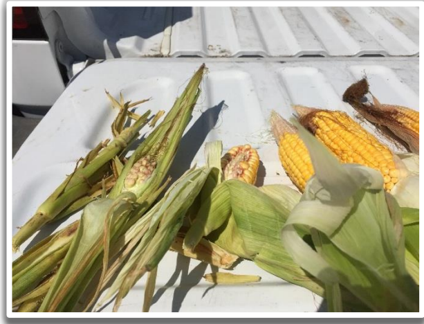
Figure 2. Acute drought stress during corn pollination can cause poor grain set and ear formation (left).

Figure 1. Chronically droughtstressed corn (left) is shorter with thinner stalks and poorly developed ears and tassels.