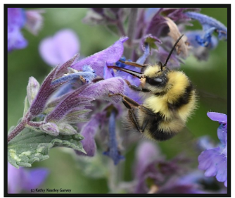
Yellow Faced Bumble Bee

You have probably seen the large, fuzzy bumble bees in your garden. The most common types we see locally are black or yellow-faced bumble bees. Both varieties have fuzzy abdomens and nest in underground holes or above-ground dark cavities with other bees. They are usually around for a longer period than other native bees, spanning from March through August. They are attracted to many flowers and if you have tomato plants, you will probably want bumble bees in your garden for pollination.