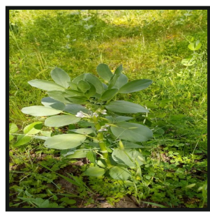
Fava Bean Plant Beginning to Flower