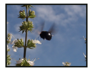
Carpenter Bee

This bee always seems to follow me when I am out gardening, as if trying to tell me something. I never worry if he gets too close since he is male and does not have a stinger – truly breathtaking to see!