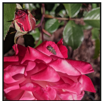
Lady Beetle (Ladybug) Larvae