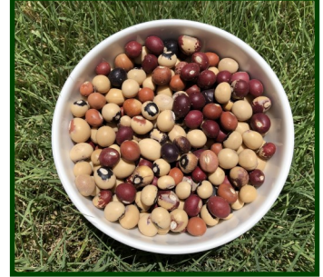
Bambara Seeds

California is getting hotter, particularly the Central Valley. This alone provides some motivation to think beyond growing just tomatoes, melons or even beans in the home garden. There is a whole world of food crops that have never spread with the same success as plants like wheat, corn or potatoes, and many of them grow well in hotter climates