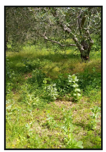
Field of Rye Grass Going to Seed with Fava Beans and Sweet Peas in Olive Orchard

I think that the biggest question is whether to use a commercially prepared fertilizer to replace nitrogen in your soil, or to do it organically. A fertilizer from the store is made to act more quickly but doesn't last as long in the soil. The variables are how much you put out, the amount of water in the soil, and how fast the water drains through the soil. The organic route takes longer but actually produces better results. Since our olive grove is organic, Jacob planted rye grass, sweet peas and fava beans.