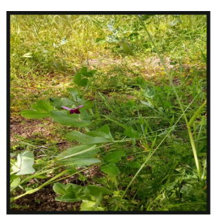
Sweet Pea Beginning to Flower

So now, let's torture ourselves with a little chemistry review. I know that we Master Gardeners did this in our soil science section, but frankly, for me, this was a section that I had to revisit many times and I still have to review it pretty much any time that I get a question about soil nutrients. Nitrogen is balanced in the soil with carbon. The most productive soil ratio is 10-12 or 10-15 parts carbon to 1 part nitrogen -- depending on the source. Nitrogen makes up 78% of our atmosphere, but in its gaseous form, it can not be used by most living organisms and must be changed to a usable form. Nitrogen is essential in protein, amino acid, DNA, and energy production. In plants, chlorophyll is that essential component. In the soil, the native bacteria are. Getting nitrogen to the plant roots requires it to be converted to a usable form and bacteria are a crucial factor in