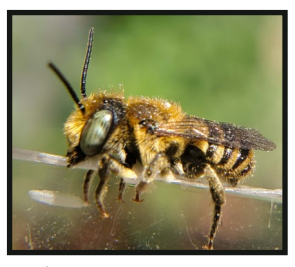
Leafcutter Bee

Leafcutter bees are interesting native bees that nest in preexisting cavities, similar to the mason bees mentioned at the beginning of this article. Leafcutter bees are very efficient vegetable garden pollinators. Some types of leafcutter bees are even used in commercial operations for pollination of blueberries, alfalfa, and carrots.