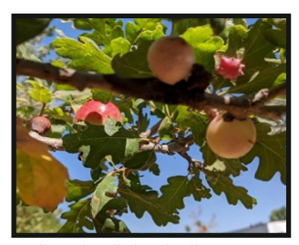
Valley Oak: Ball-Shaped Galls Are Home to Larvae of California Gallfly; Pink Galls Are Home to Pink Turbine Wasp Larvae

Change the world, one seed at a time; change the world, one plant at a time; change the world, one kindness at a time. When I work in the garden, my thoughts take me far beyond what I see and touch. This experience is truly 'Beyond Gardening'. ¤