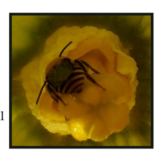
Squash Bee Resting in Squash Blossom

There are many species of squash bees. The type you are probably going to see the most look similar to European honeybees, except these are slightly larger and have longer antennae. One way you will know that they are squash bees is if you spot one sleeping inside a squash plant flower, which closes up in the late afternoon.