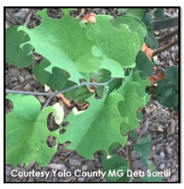
Leafcutter Bee Leaf Clipping: Photo by Deb Sorrill

leaves with smooth (not jagged) half-moon and full circle cuttings, a sure sign that leafcutters are hanging out close by to your garden!