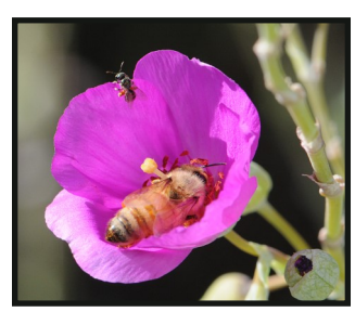
Two Bees on Rock Purslane

They are called sweat bees because they love human sweat! But fear not, they are not aggressive, and the males do not have stingers. These small bees are highly effective pollinators for cultivated crops and wildflowers. Sometimes they nest in softwood, but usually live underground.