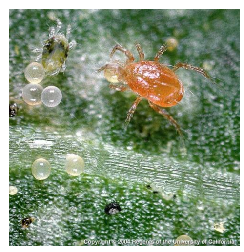
Photo 1. Predatory mite (right) eating the eggs of a spider mite (left).

In the Sacramento Valley there are two main predators to look for. The first are species of predatory mites (phytoseiids, Photo 1). These are good mites that eat the bad mites. Phytoseiids have a tear-dropped shape, a shiny appearance, and are often seen running around on leaf surfaces in search of food. They have historically been the main predators found in almond and walnut orchards in the Sacramento Valley.