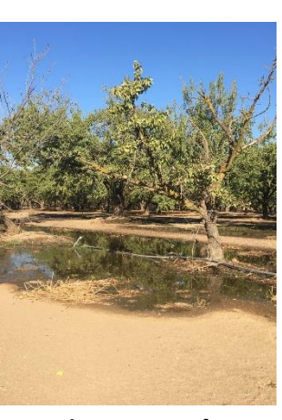
The Dangers of Irrigation Leaks

To simplify information, trade names of products have been used. No endorsement of named products is intended, nor is criticism implied of similar.