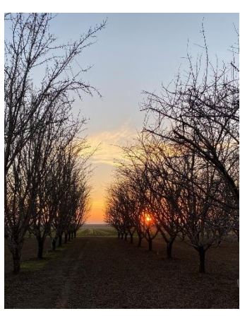
Field Evaluation of Almond Varieties