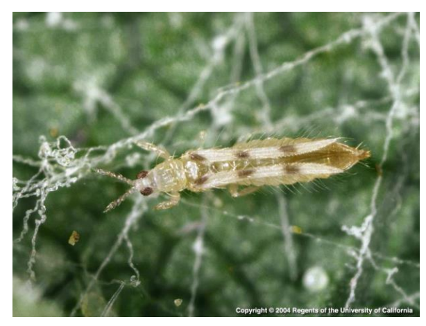
Photo 2. Sixspotted thrip adult, characterized by three dark spots on each of its two fringed wings.

The second predator that has become increasingly important over the past few years is the sixspotted thrip (Photo 2). This predator feeds almost exclusively on mites, can double its population every 4 days, thrives in hot dry conditions, and loves to navigate within spider mite webbing in search of food.