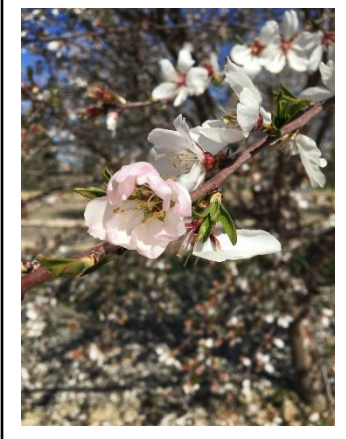
Craig Ledbetter on the USDA breeding program

Weekly episodes from Growing the Valley podcast keep you up to date with the latest UC best practices in almond, walnut, prune, and pistachio production! Listen at: <a href="mailto:growingthevalleypodcast.com">growingthevalleypodcast.com</a> or wherever you listen to podcasts.