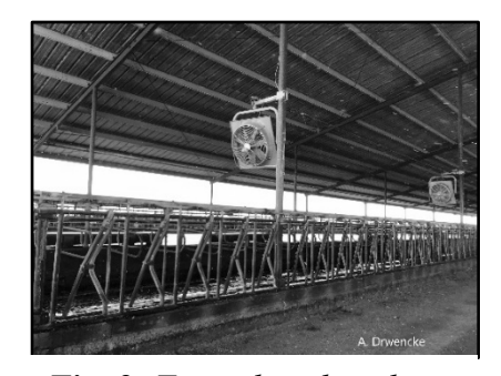
Fig. 2: Fans placed so that they cool cows at the bunk; moving air over wet animals removes more heat than when they are dry and means we need less soaking overall.

already risen. Cows start feeling hot sooner than we do, usually when the air temperature is about 72°F. To ensure water is turned on and off only when needed by the cows, automated controllers help keep things consistent. The location of the controllers is also essential to provide cooling and save water. It works best if they are placed in the barn to capture the weather that the cows experience.