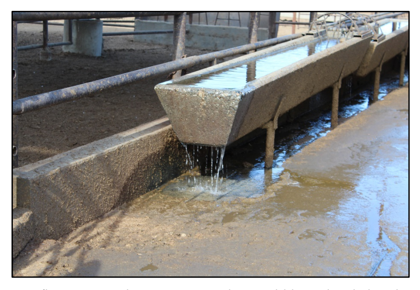
Overflowing troughs waste water that could be utilized elsewhere.

(Are there any cows standing at the mister line at midnight?)