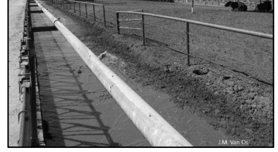
Fig. 1: Soaking an empty, unshaded bunk. More cows would benefit from this water if the bunk was shaded.

Turn on soakers early & use automated controllers. Turning on soakers earlier helps cows keep cool from the start and is more efficient than trying to cool them down once body temperature has