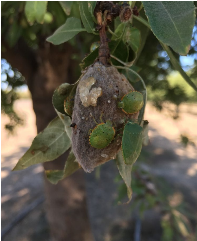
Image 1: Large stink bug populations can lead to significant feeding damage on nut crops, such as these green stink bugs ( Chinavia hilaris ) on almonds.

Anecdotally, UC personnel have heard reports of increased presence of bug species in orchards, possibly because pyrethroid use to control NOW has decreased over the past decade. Over the past few years, we have personally visited a handful of almond orchards that have been heavily hit by stink bugs; one almond orchard I visited was devastated by this pest (Image 1). We do not advocate preventative pyrethroid use to try to keep these insects down. There are very few registered insecticides that control large and small plant bugs and losing them because of evolved resistance from overuse could be devastating. Additionally, using these products can lead to issues with other pests, so it is best to use them only when needed. However, it is important to keep an eye on your orchards to stop these pests once they do appear.