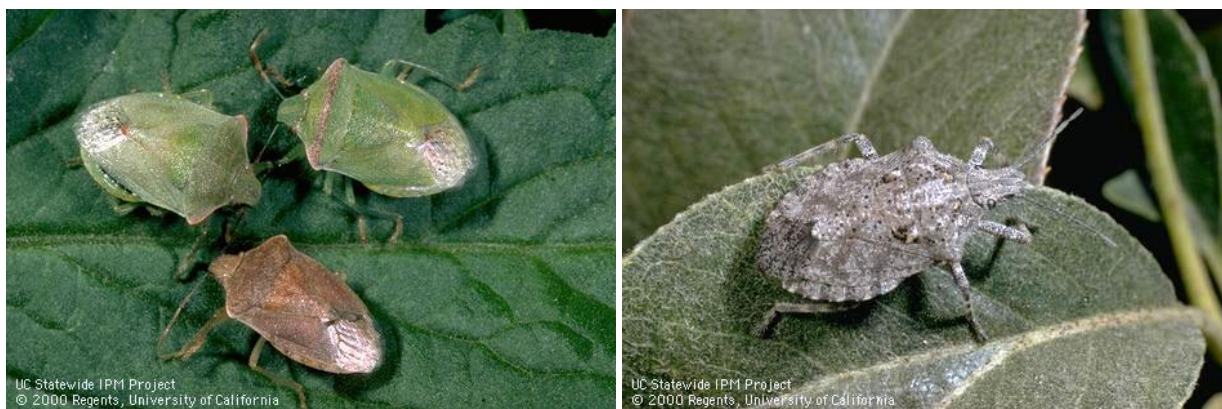
Image 3: Left: Redshouldered stink bug ( Thyanta custator accerra ), green stink bug ( Chinavia hilaris ), and consperse stink bug are some of the large bug pests you may find in your pistachio orchard. Right: Rough stink bug ( Brochymena quadripustulata ), which is a beneficial insect.

Leaffooted bugs (LFB) and stink bugs, due to their larger stature, have larger, stronger mouth parts and can damage developing pistachio nuts after shell hardening as well as before. Research on “hidden damage,” or feeding damage to the kernel that does not result in an obvious lesion on the pistachio hull, showed that external signs of feeding damage is significantly reduced during mid June (Daane et al., 2005). Feeding can still occur after the fruit stops showing external damage; in the previously cited research trial, kernel necrosis increased starting in May and peaked in August. While bugs were feeding on pistachio nuts before May, those nuts were most likely aborted.