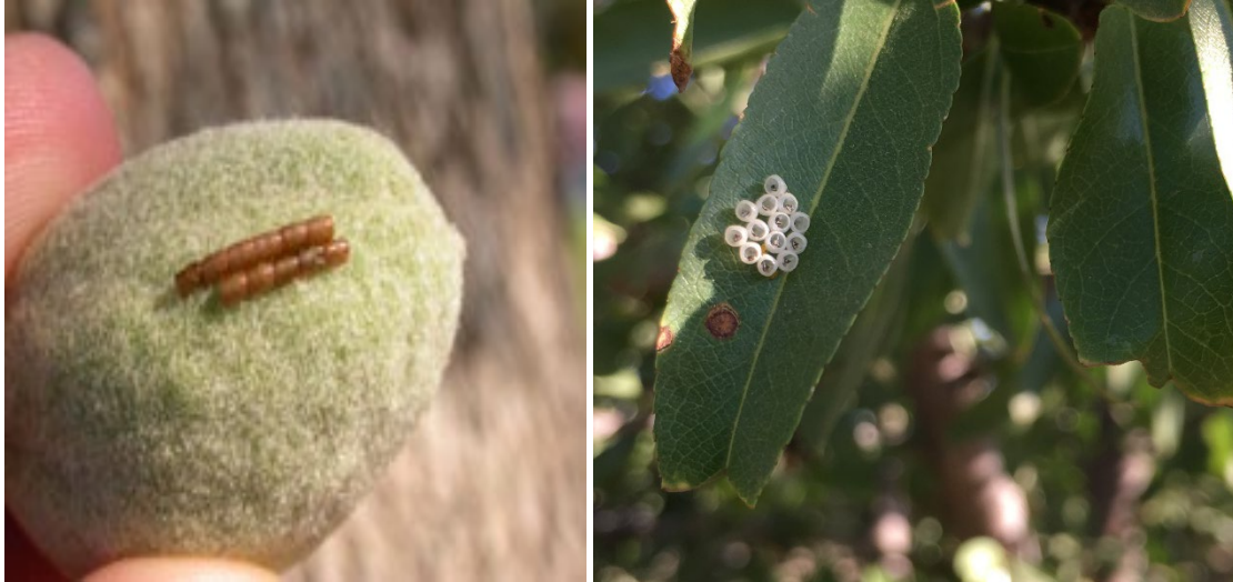
Image 5: Leaffooted bug eggs (K. Tollerup) and stink bug eggs from which nymphs have already emerged.