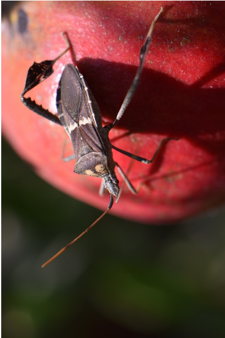
Image 2: Leaffooted plant bug, specifically Leptoglossus zonatus . Note the wide, leaf-like structures on the hind legs.

Leaffooted plant bugs and stink bugs are the two groups of potentially damaging large plant bugs you may find in your pistachio orchard. There are three species of leaffooted plant bugs (Image 2) that can be found in pistachio orchards, though Leptoglossus zonatus is the most common species. All appear similar in shape and coloration and have an enlarged area on their hind legs resembling a leaf. There are also several different species of stink bug (Image 3); all have a common shield-like shape to their bodies, though they will differ in coloration. We recommend making an effort to identify stink bugs before treatment, as the rough stink bug is an insect predator that can commonly be found in pistachio orchards.