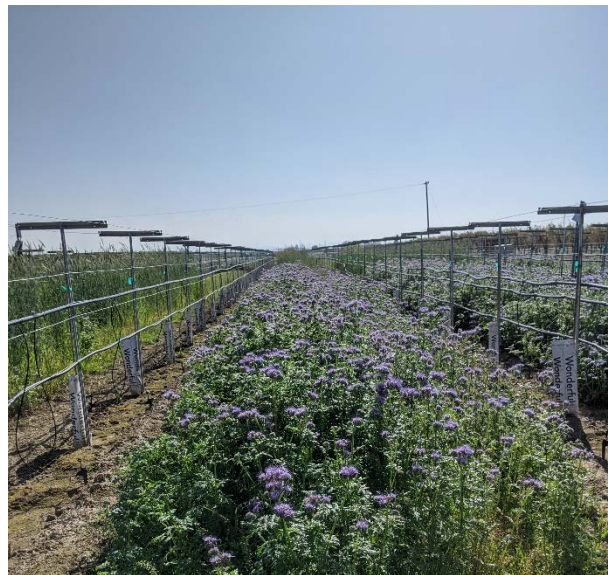
Cover crop trial in Parlier.

The April webinar will cover research on water dynamics in a new table grape vineyard in Parlier. We will also interview growers that utilize cover cropping in perennial cropping systems: grapes and almonds. Growers will share their insights on cover crop management, challenges, and benefits.