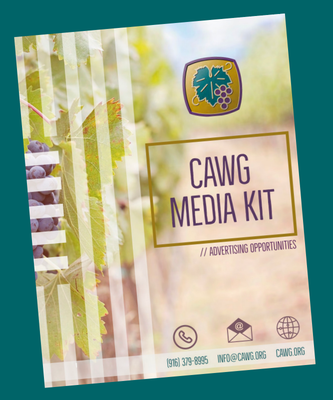
VIEW OUR MEDIA KIT!

Provides an opportunity for additional exposure to the winegrape industry. The annual digital directory is a comprehensive guide to the many vineyard management products and services available to our CAWG growers. This valuable reference guide has search capabilities with the option to link your advertisement directly to your website or product page. This is a MEMBERS ONLY guide; advertisements are not available to non-members.