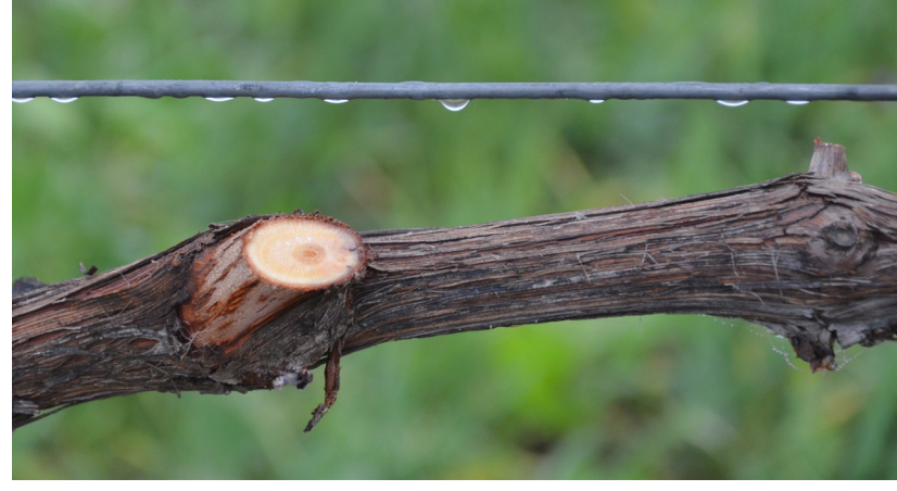
Example of a clean cut. Pruning wounds are susceptible to infection by fungal spores during the rainy season in December and January.

Eskalen's research lab conducted trials in 2019 and 2020 and posted reports: Evaluation of Biological and Chemical Pruning Wound Protectants Against Selected Fungi Associated with Grapevine Trunk Diseases. These trials specifically evaluated efficacies of protectants against E. lata and N. parvum. Three 2020 trials were conducted in Elk Grove, Delano and Davis. More information is available at the Eskalen lab webpage, with