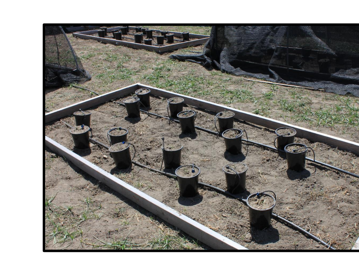
Fig. 2. Potted junglerice plants under different levels of shade (L) and soil moisture (R).

MATERIALS AND METHODS: A study was conducted in Fresno, CA in summer 2016, 2017, and 2020. Seeds of previouslyconfirmed GR junglerice were obtained and sown in seedling trays. Once they developed 4-6 leaves they were planted into 3.81 plastic pots containing field soil. Three levels of shade (70%) shade, 50% shade, and 0% shade) were imposed using shade cloth of various transparency (Fig. 2) and two soil moisture regimes [(100% and 50% of field capacity (FC)] were imposed after determination of FC by a tensiometer. Each pot was individually irrigated with an automated drip irrigation system. The plants were treated with label rates of the selected herbicides between the second leaf and the first tiller stage. Herbicide applications were made with a CO_2 backpack sprayer calibrated to spray at 2801 ha<sup>-1</sup> at 40 psi. Spray height was maintained at 45 cm. An untreated control was also included. Irrigation levels were maintained based on daily measurements with a TDR 100 soil moisture meter. The experimental design was a split-split-split plot with shade as the main effect, soil moisture as the sub-effect, and herbicide type as the sub-sub effect. Mortality of these plants were evaluated every 7 days after treatment (DAT) and plant biomass and number of seeds on each plant was recorded at 28 DAT (Fig. 3). The study was conducted twice. Data were analyzed using analysis of variance procedures in SAS at a