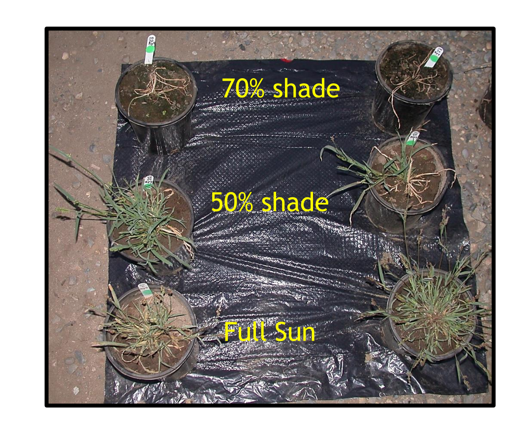
Fig. 3. Plants treated with glyphosate at 50% FC (L) and 100% FC (R) under different levels of shade.

significance level of 0.05. Interaction between the various factors were also tested. There were no interaction between the experimental runs and any of the factors; therefore, data for the two runs were combined.