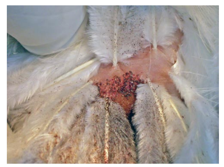
Figure 4. Northern fowl mites feeding on poultry.

A chicken mite can complete its life cycle in as few as 7 days. Adult females lay small groups of eggs in the environment surrounding their avian host. Eggs hatch in approximately 2 days, and the hatched larvae molt in 1 to 2 days without feeding. At all other life stages, this mite feeds on blood. Adult chicken mites can survive up to 34 weeks of starvation, so they are able to survive long periods where nests or poultry houses are unoccupied. This makes treatment of the entire poultry facility imperative if you want to control this pest.