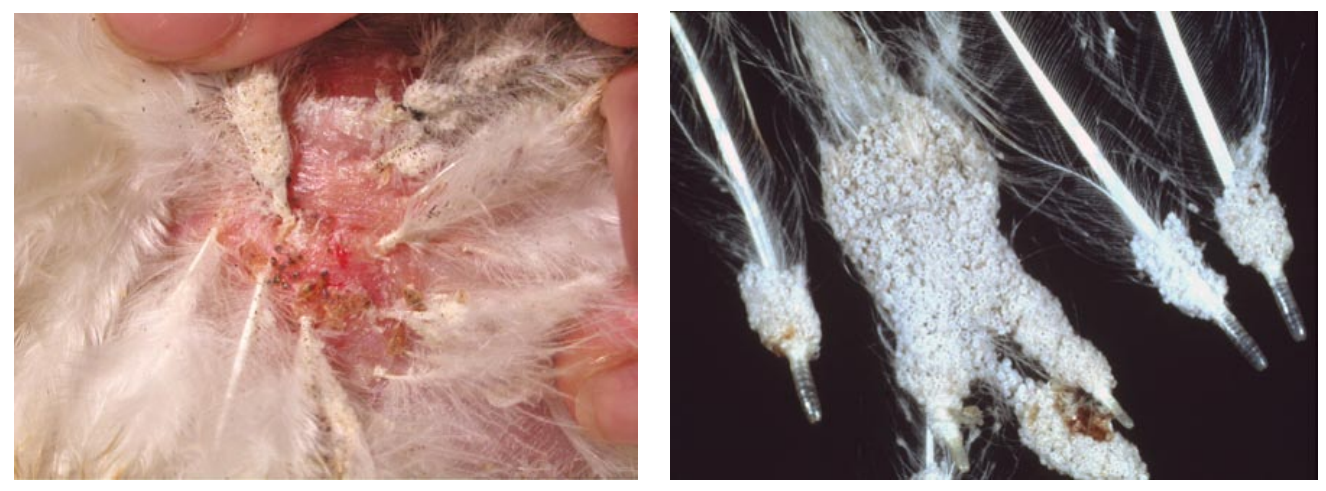
Figures 1 ( left ) and 2 ( right ). Egg clusters of the chicken body louse on base of vent feathers. Each egg is less than 1 mm long.

Birds should be checked for lice at least twice a month. Examination involves spreading the bird's feathers in the vent, breast, and thigh regions to look for egg clusters or feeding adults at the base of the feathers. The presence of some lice on most birds or of egg clusters on one or more birds is enough to indicate the need for treatment. Chemical treatment, if required, should be applied at 10- to 14-day intervals until the lice and nit numbers fall below this level. Louse eggs are resistant to insecticides, so a single insecticide treatment may not be sufficient to provide control. Louse eggs will subsequently hatch when the insecticide is no longer active. By re-treating at 7- to 10-day intervals, you can kill the newly hatched generation that survived the previous chemical treatment before they can grow to adulthood and lay additional eggs.