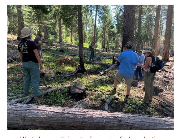
Workshop participants discussing fuels reduction projects during the in-person field day at Blodgett Research Forest in July 2020

• "Thank you for offering this workshop. Even in a pandemic it was effective. Now I have work to do!!"