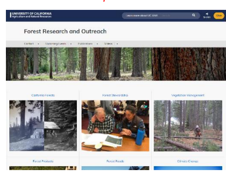
The Forest Research & Outreach web-page