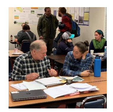
Workshop participant working one-on-one with a Registered Professional Forester

manage their property. It has been key to being able to quickly transition to on-line learning.