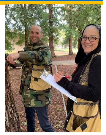
Participants measuring tree diameter during a workshop

This report is intended to update the Forest Management Task Force on implementation of the Forest Landowner Outreach and Education Working Group recommendation on forest stewardship education. The goal of the Forest Stewardship Education Initiative is to engage forest landowners to better understand and protect their forests by developing a forest management plan. Participants develop management objectives, learn basic concepts on forest and fire ecology; fuels reduction and forest resource marketing; and develop mapping and inventory skills. Participants interact with Registered Professional Foresters and other forestry professionals to help develop their plans and participate in cost-share opportunities.