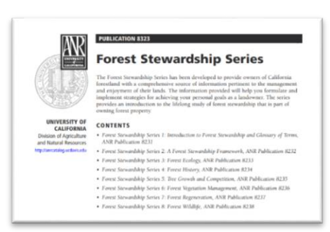
The cover page of the 24-part Forest Stewardship leaflet series

The workshop content is based on the <a href="24-part Forest Stewardship Series">24-part Forest Stewardship Series</a>, a peer-reviewed publication series on forestry and forest management published by the University of California Cooperative Extension, targeted at family forest owners. The workshop provides instruction based on this information and also includes hands-on activities to help participants implement concepts. Interactions with instructors, other participants, and forestry professionals empowers participants to develop their management goals by asking questions and making informed decisions. Materials for the workshops, along with the Forest Stewardship leaflet series are hosted on the UCANR Forest Research and Outreach website, <a href="https://ucanr.edu/forestry/">https://ucanr.edu/forestry/</a>. Experienced landowners are empowered to share their experiences with others during the workshops. This includes those that already have management plans and, members of fire safe councils and prescribed burn associations.