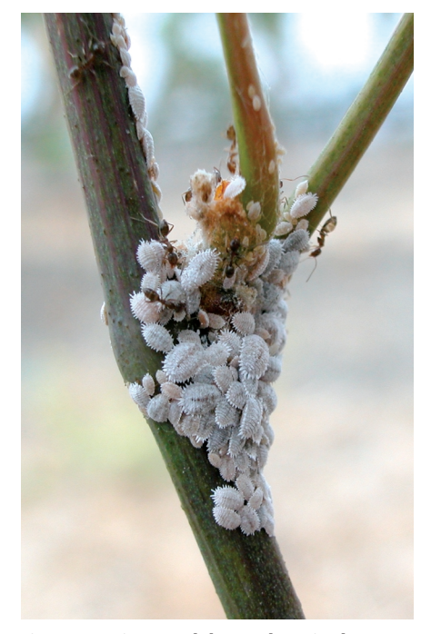
Figure IV. Vine mealybug colony in the axils of the petiole and cane.

The overwintering generation develops through the spring, reaching maturity in late May and June. At that time, the adult female returns to the