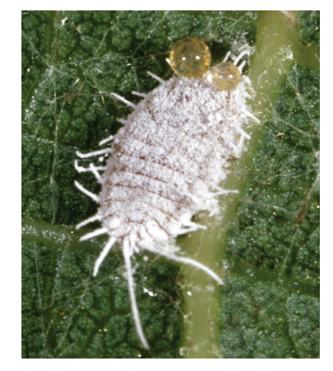
Figure III. Clear fluid excreted by obscure mealybug.

In late winter the youngest nymphs (called crawlers), emerge and, shortly before bud break, they move from old wood to the spurs where they gather under the thin bark on one-year-old wood. After bud break, a portion of the population moves to the basal leaves and shoots while the rest remain under the bark primarily on the upper