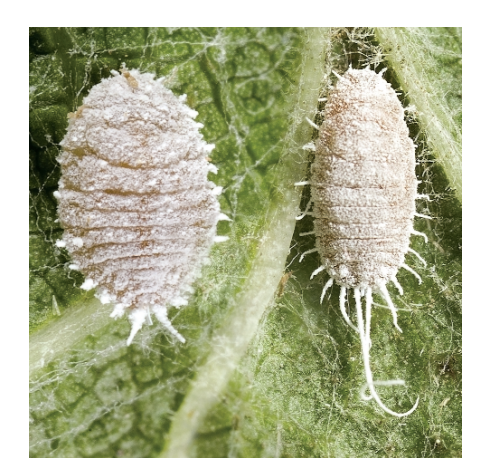
Figure I. Vine mealybug female (left) with oval body shape, thick, even (uniform) filaments and short tails and grape mealybug (right) with rectangular body shape, thin, slightly unparallel (non-uniform) filaments and long tails.

vine mealybug. It is more difficult to see the long tails in younger stages, however Pseudococcus immatures can still be distinguished by the rectangular body shape and by the thin, irregularly formed filaments surrounding the body.