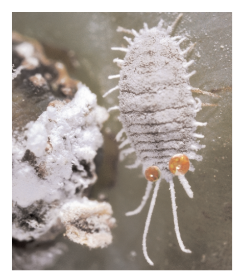
Figure II. Reddish orange fluid excreted by grape mealybug.

Grape and obscure mealybugs can also be distinguished from each other by the color of a defensive fluid they secrete when threatened. The fluid is exuded as a droplet from pores at the anterior and/or posterior end of the body. Gently poke the insect with a sharp object without puncturing the body until the fluid is excreted. If the