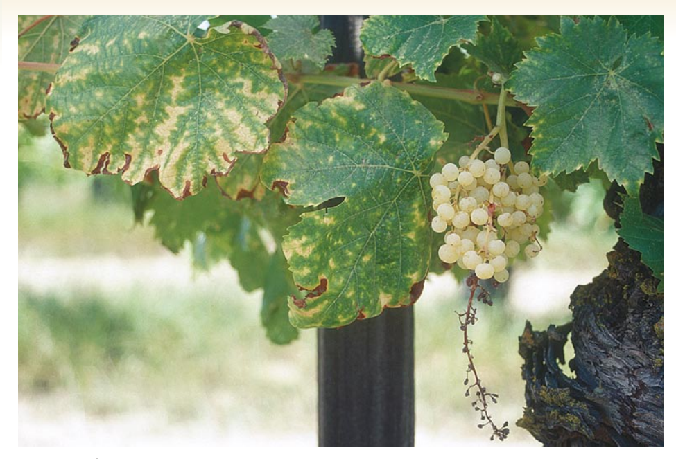
A boron-deficient Thompson Seedless cluster in the trial vineyard shows reduced fruit-set, the presence of numerous pumpkin-shaped "shot berries" and necrosis of some branching. Fewer than 10% of the berries are normal size and shape.

Grapevine reproductive tissues are most sensitive to boron deficiency, which results in reduced fruit-set, small "shot berries" that are round to