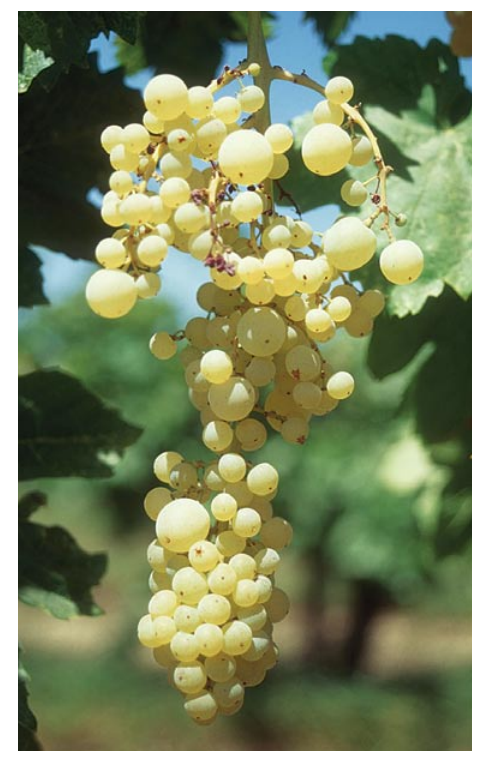
Boron foliar sprays applied in the fall were the most effective treatment to prevent, above , boron deficiency symptoms in grapes.

ments were an untreated control and a foliar boron spray at 1 pound per acre applied as Solubor (20.5% boron) at 100 gallons per acre (gpa). The trial design was a randomized complete block with four-vine plots, replicated 10 times. Vine tissue samples were taken at bloom on May 23, 1998; triple-rinsed with distilled water and oven-dried; and analyzed for boron at the ANR Analytical Laboratory at UC Davis.