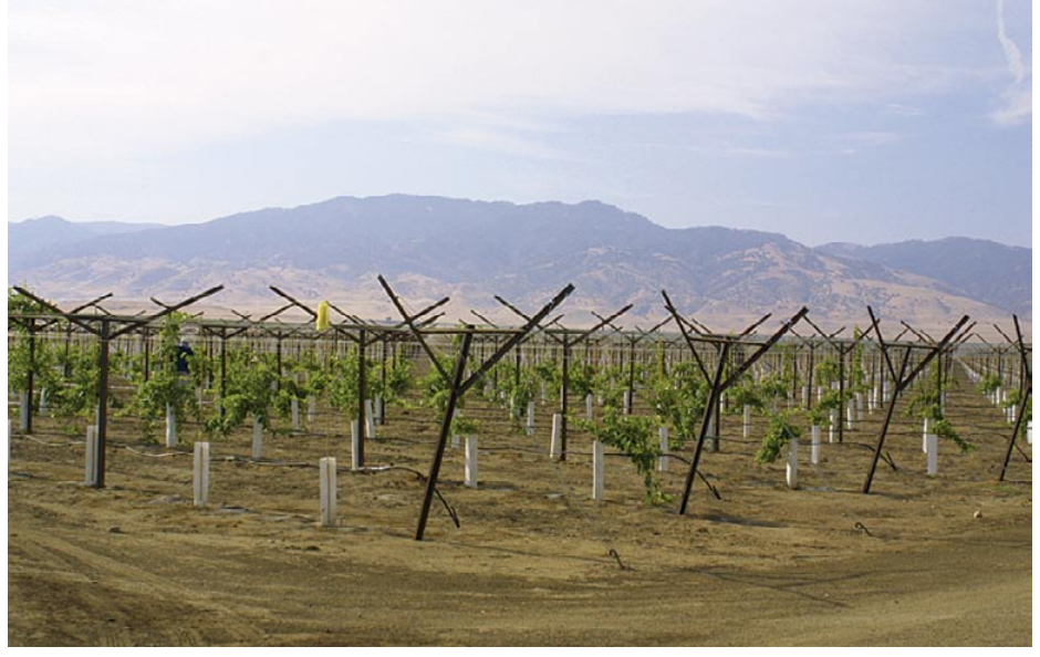
Boron deficiencies are common in the old flood plains and alluvial fans of California's Central Valley. Above , a newly planted table grape vineyard.

grapevines are susceptible to temporary boron deficiency of developing tissues during periods of drought, suggesting limited boron mobility.