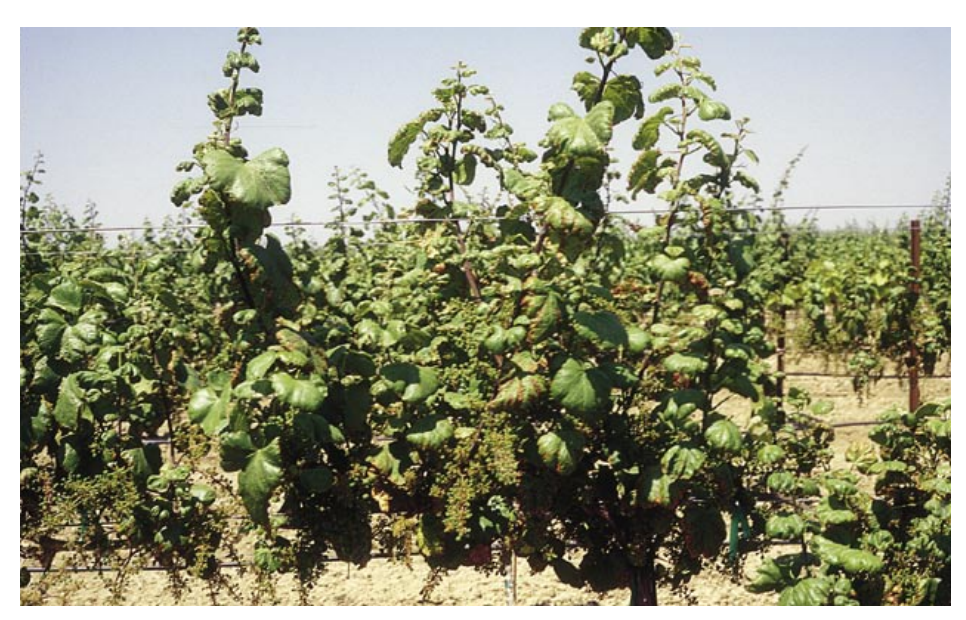
Symptoms of boron toxicity include leaves that are cupped downward with necrotic margins on mature leaves.

The results of this research can be applied to other drip-irrigated vineyards in the San Joaquin Valley under similar conditions: rapidly drained soils, highquality irrigation water, and low boron content in soil, water and vine tissue. In other regions of the state where winter rainfall is much higher, there would presumably be more leaching of boron fertilizer during winter months and less carryover time after fertilization is discontinued. In contrast, less leaching and greater carryover of boron would be expected in areas of less rainfall or on soils with finer texture and higher water-holding capacity. The amount of boron fertigation used in a maintenance program will vary with leaching potential. These variables underscore the importance of monitoring boron in tissue when developing a long-term fertilization program.