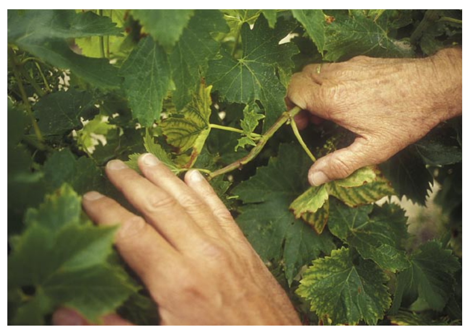
Boron-deficient vines have, facing page, bottom, clusters that set numerous shot berries, small berries with a distinctive pumpkin shape; or, facing page, top, calyptras that stick on young, developing berries. Above, shoots have shortened and swollen internodes, and shoot tips sometimes die.

The goal of boron fertilization of grapevines is to keep tissue levels within a narrow range, since both deficiency and toxicity can have serious negative effects on vine growth and production.