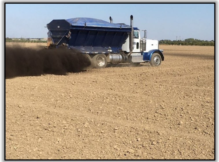
Photo 1. Compost application to Field One-North and Field Two-South on October 30, 2019.

Compost amendments can be used to build soil organic matter and promote efficient cycling of plant nutrients. The emergence of financial incentive programs, along with the relatively low cost of composts, make these amendments an economically attractive way to build soil health and increase plant-available nutrients. Managing compost according to the "4Rs" (right source, right rate, right time, and right placement) becomes difficult when considering the "right time" of compost application. This is because compost require decomposition amendments following soil incorporation to release nutrients and the timing of nutrient release may or may not correspond to the time of greatest crop demand. Applying compost in the fall, following harvest, would be the most convenient application time for