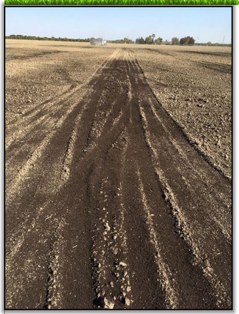
Photo 2. Compost on soil surface prior to tillage incorporation to a 6" depth.

December 2019 in F1N ranging from 19 to 22 lb N/Ac, whereas, in F2S inorganic nitrogen availability of the 15T/Ac compost was noticeably lower (13 lb N/Ac) compared to 5 and 10 T/Ac compost which ranged from 27 to 29 lb N/Ac ( Table 1 ). Over the next three months (January to March), inorganic nitrogen availability remained similar between 5 and 10T/Ac compost for both F1N and F2S with differences of only 2 to 3 lb N/Ac. Whereas, the application of 15T/Ac compost resulted in the lowest inorganic nitrogen availability