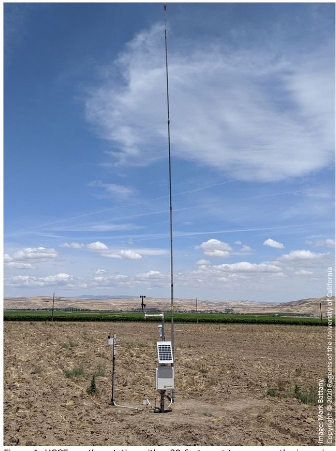
Figure 1. UCCE weather station with a 30-foot mast to measure the inversion condiitons.

These stations measure common variables of air temperature, humidity, rainfall, solar radiation, and wind speed, plus calculated variables such as the dew point and the reference evapotranspiration. They also have an additional air temperature sensor 30 feet above the ground to be able to measure the temperature inversion. This measurement is very useful to understand frost conditions and to better understand how we might respond to protect crops from frost damage. In particular the strength of the inversion can help us determine if wind machines will be useful during particular frost events; some earlier work describes this in detail (see the <u>December 2011 Grape Notes</u>).