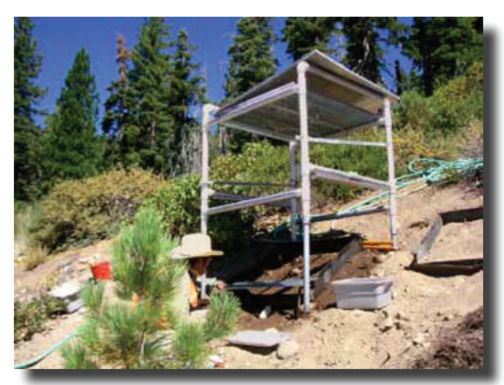
Rainfall simulation is a tool that is used to simulate rainstorms and directly measure surface erosion and infiltration rates.

*The duff fire risk results are based on one study and may vary based on climatic factors and duff composition.