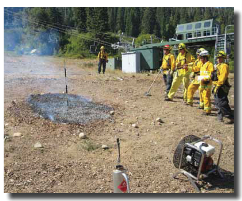
The study team partnered with local fire districts to measure burn characteristics of different mulches.

Living with Fire in the Lake Tahoe Basin Home Landscaping Guide for Lake Tahoe and Vicinity IERS (www.IERStahoe.com) Tahoe RCD (TahoeRCD.org) Local Fire Districts