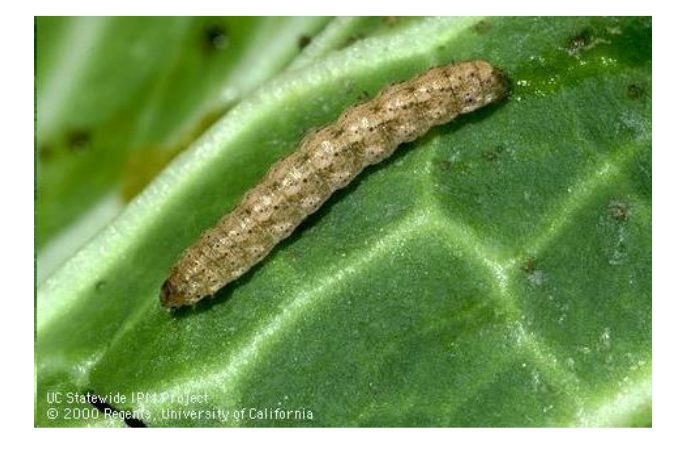
Fig. 1. Granulate cutworm caterpillar.

The caterpillars are about an inch long when mature, dark gray in color (Figure 1), and the surface of its body is covered with black granules which can be easily seen under a microscope. These granules contribute to this insect's common name.