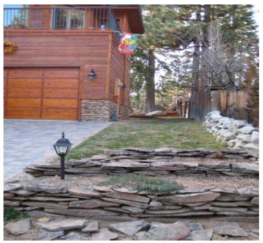
Figure 3 Rock mulch has been extended around the base of the house. Stone facing at the base of the house reduces the risk of having combustible wood siding

Current interpretation of the defensible space law encourages homeowners to maintain a 'lean, clean and green' landscape between 0 and 30 feet from the home and a 'reduced fuel landscape' between 30 and 100 feet