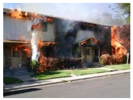
Figure 5 A cigarette thrown out the window into a 'foundation planting' of ornamental junipers burned this apartment in Reno

Hopefully with a few strategic changes in your near home zone, you can make fire safety the 'foundation' of your landscaping.