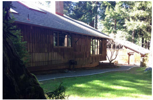
Figure 1 Vegetation has been separated from the house and its combustible siding by installation of an asphalt walkway. (not sure who took this picture)

Do you have foundation plantings around your house? Many of our homes do – either we planted vegetation close to the house's foundation or it was there when we bought the home. This vegetation is a legacy of the concept of 'foundation planting' promoted by landscapers and landscape architects as a way to frame a house and anchor it to the site. A quick review of landscaping websites will reveal that planting trees, shrubs, vines, grasses, and ground covers around a house is still promoted to create a transition between the built environment and the rest of the garden.