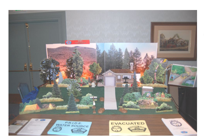
Special Effects table display by the Sierra Fire District.