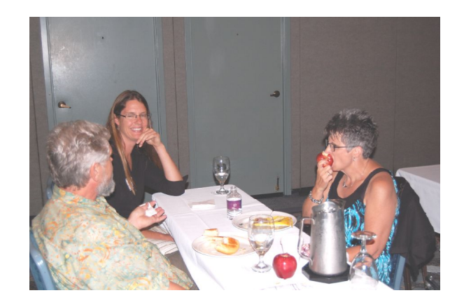
Attendees visit over lunch during the summit.