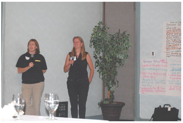
Reporting back from the fire agency break out groups.