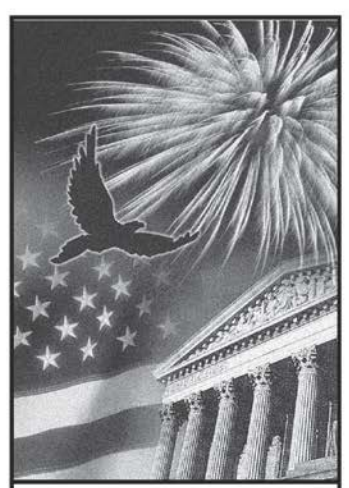
Get forms and other Information faster and easier by: Internet IRS.gov