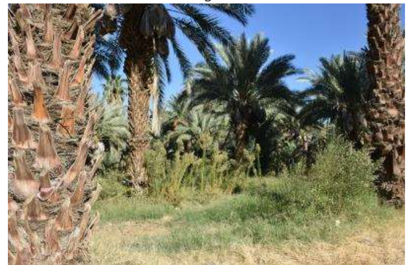
Topics in Subtropics Page 4