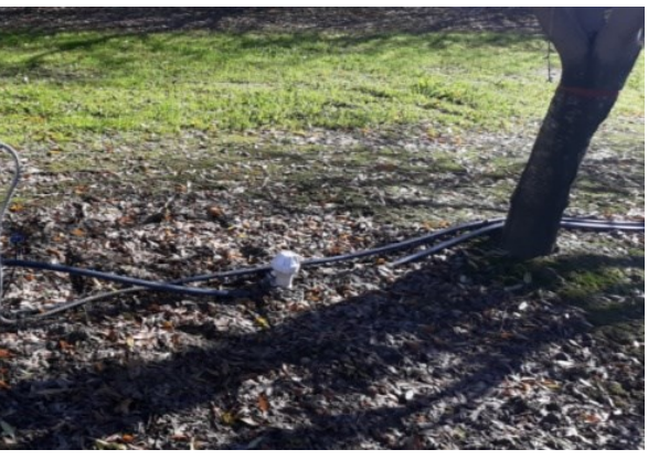
Figure 6. Irrigation scheduling technology. ET station (top left), plant water status sensor (top right), and soil moisture sensor (bottom).