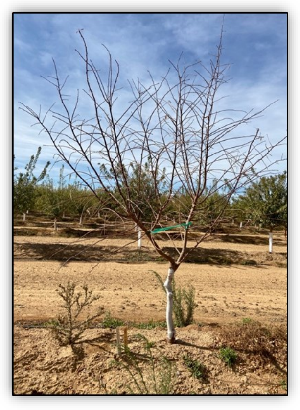
Figure. 1 Herbicide Damage in 2^{nd} leaf almonds. Glufosinate + Glyphosate (1.5 + 2.75lbs/ac). Image on the left is trunk gummosis observed 5 weeks after treatment. Image on the right shows complete defoliation of the same tree 12 weeks after treatment.