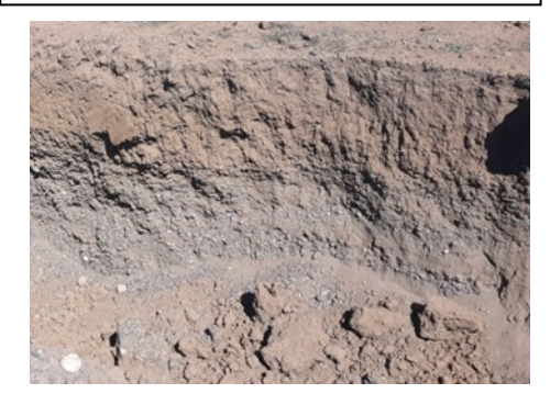
Figure 4. Layered orchard soil considered for soil modification and/or zone irrigation management.

precisely design irrigation systems so that soils with distinctly different water infiltration and water holding characteristics can be irrigated in separate sets. This approach is referred to as variable rate irrigation (VRI) or zone irrigation. Refer to UC ANR Publication 3507, Prune Production Manual, Chapter (https:// www.youtube.com/watch?v=rz ER49fZEA) and zone irrigation management articles found on the Sacramento Valley Orchard Source. (http://www.sacvalleyorchards.com/?s=zone+irrigation).