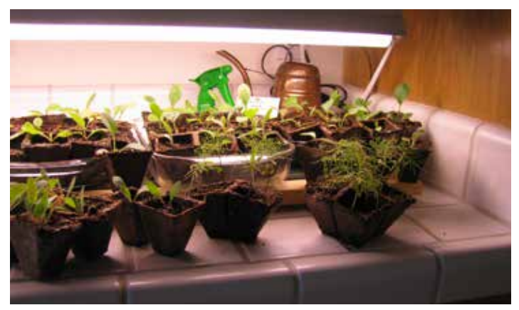
Providing the proper light conditions will improve germination rates.

Hopefully this gives you a start on what might have gone wrong and how to do it right next time.