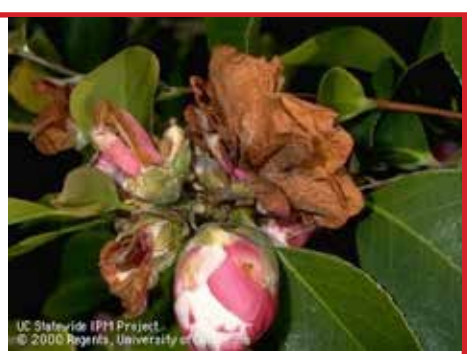
Blossom damaged by Camellia petal blight.

Do you have gardening questions? Call the Master Gardener Hotline in your county Nevada Co. 530-273-0919 Placer Co. 530-889-7388