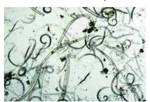
Assorted nematodes under a microscope.

Predatory or parasitic nematodes are perhaps more commonly associated with organic gardening methods as part of IPM. These parasitic roundworms can be purchased to attack a variety of plant pests such as slugs, weevils, lawn grubs, carpenter worms, fungus gnats, and artichoke plume moths. With more than 15,000 known species of nematodes and an estimated 500,000 more, nematodes are one of the most abundant groups of animals second only to arthropods. In fact, it is believed that every organism on earth is infested