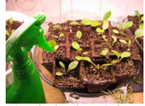
Mist seeds to keep them moist, but not too wet.

But it is also important to know that some seeds need more than just the basic germination conditions. Some seeds have special requirements to urge them out of dormancy. These requirements might be soaking, scratching, firing, cold storage, or other unique treatments. Making sure that you know if your seeds have any special treatments required will increase your success rate.