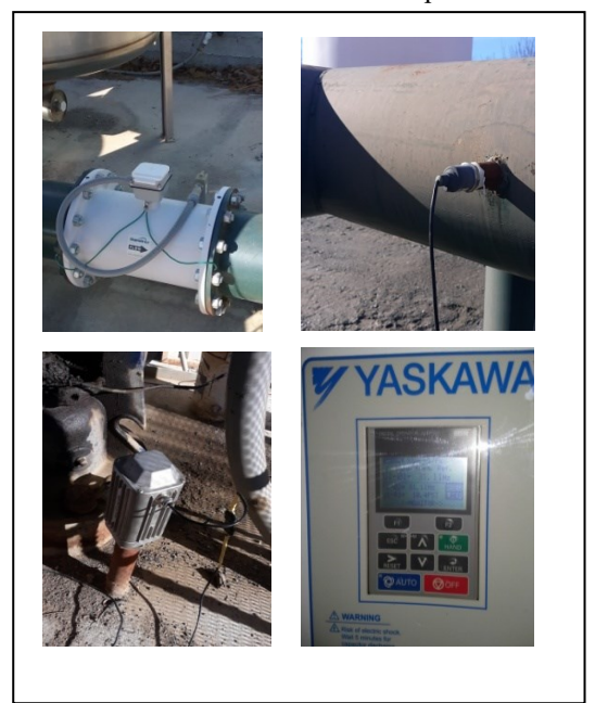
Figure 3. Magnetic flow meter (upper left), pressure transducer (upper right), acoustic groundwater level sensor (lower left), and VFD digital control panel (lower right).

Figure 2. Schematic showing orchard irrigation system beginning with the well and pumping plant and extending out to the last lateral line and sprinkler or