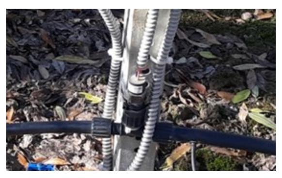
Figure 5. Pressure transducer on irrigation line (top) and flow meter on injection pump (bottom).

It is becoming easier to collect and analyze pressure and flow data from an irrigation system. Pressure gauges or