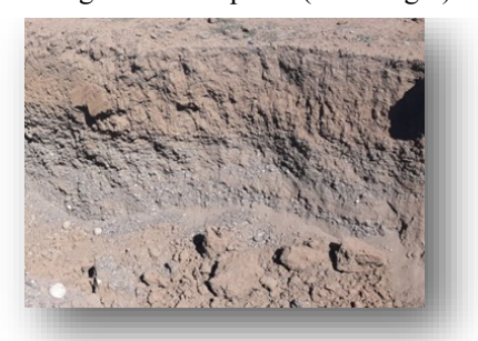
Figure 4. Layered orchard soil considered for soil modification and/or zone irrigation management.

Figure 3. Magnetic flow meter (upper left), pressure transducer (upper right), acoustic groundwater level sensor (lower left), and VFD digital control panel (lower right).