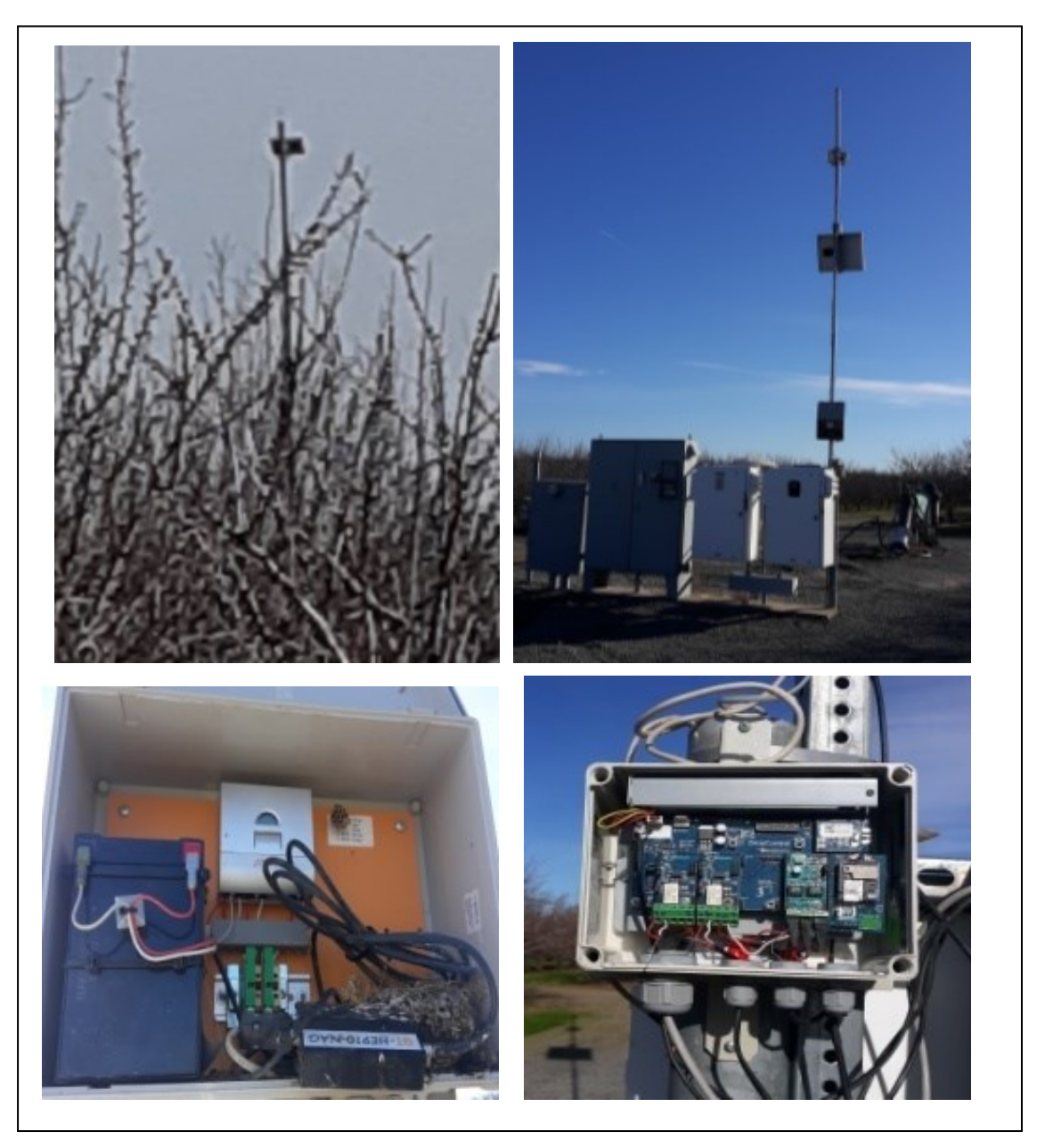
Figure 7. Parts of a telemetry system. Cell tower and gateway next to pump controls (top left), gateway connection to internet (bottom left), orchard cell tower connected to sensors in the field (top right); and node connection to field sensors (bottom right).

Once some needs have been identified and prioritized, it may make sense to try the technology on a partial scale or even manually to establish proof of concept, robustness, and effectiveness on the way towards automation and broader adoption.