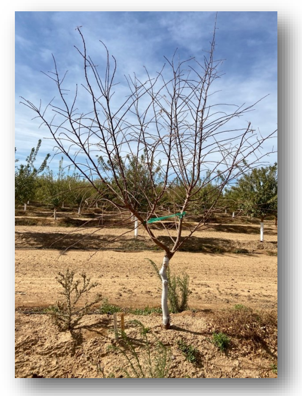
Figure. 1 Herbicide Damage in 2^{nd} leaf almonds. Glufosinate + Glyphosate (1.5 + 2.75lbs/ac). Image on the left is trunk gummosis observed 5 weeks after treatment. Image on the right shows complete defoliation of the same tree 12 weeks after treatment.