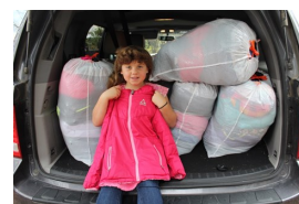
Coats for Kids (December 20th)