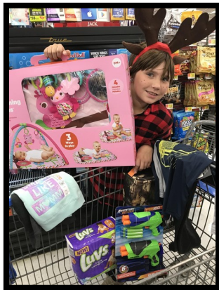
Shopping for the Giving Tree Gifts. December 2019.

I think it's a nice thing to do for the kids in our community.