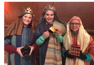
Live Nativity Scene (December 14th)

Upcoming Etna 4-H events include the Local Presentation Night in February and a Spring Bake Sale in February or March.