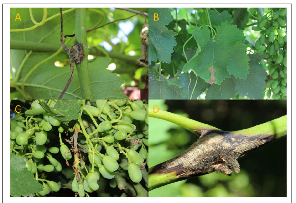
Figure 3. Botrytis shoot blight damage on different plant tissues. A) Nodes, B) Leaves, C) Clusters and Tendrils, C) Canes

suitable for pathogen to infect your crop. If rain and the optimal temperatures described previously are forecasted, consider spray at least one day before the predicted rain event.