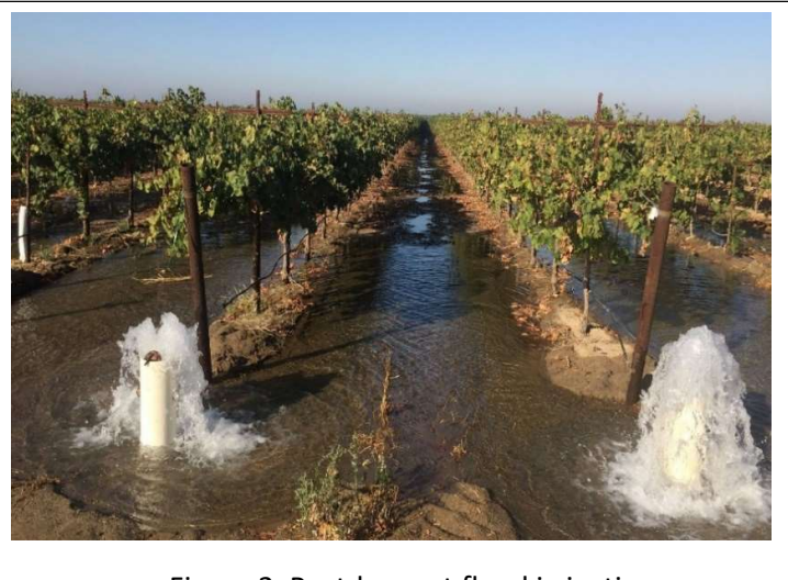
Figure 2. Post-harvest flood irrigation

Adequate soil moisture post-harvest and during dry winter, will hydrate vine tissues (cordon, trunk and