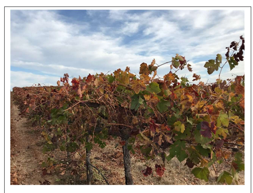
Figure 1. Wine grape canopy after mechanical harvest

Depending on production type (raisin, wine, or table grapes), irrigation type (flood or drip), management practices (deficit irrigation), and harvest type (hand vs mechanical) grapevine canopies can end the season stressed and damaged (Figure 1). Therefore, post-harvest irrigation is critical to relieve the vines from stress. This will help maximize the post-harvest canopy photosynthetic activity to accumulate carbohydrate (stored as reserve), to prepare cold hardiness (Greven et al. 2016) and hydrate the vine tissues including root to eliminate embolism (Brodersen et al. 2010). The goal of post-harvest irrigation is to avoid delayed, erratic bud break and ensure canopy early growth with sustainable yield and fruit quality on the following season. How much water is a key question for farmers when applying post-harvest irrigation. For late season varieties the goal is to apply adequate water to maintain photosynthetically functional canopy, while avoiding too much water such that vines push new growth.