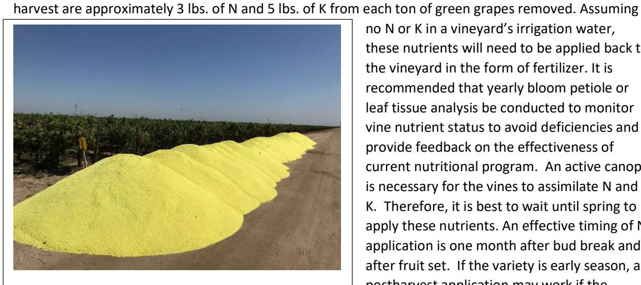
Figure 3. Soil sulfur band application post-harvest

no N or K in a vineyard's irrigation water, these nutrients will need to be applied back to the vineyard in the form of fertilizer. It is recommended that yearly bloom petiole or leaf tissue analysis be conducted to monitor vine nutrient status to avoid deficiencies and provide feedback on the effectiveness of current nutritional program. An active canopy is necessary for the vines to assimilate N and K. Therefore, it is best to wait until spring to apply these nutrients. An effective timing of N application is one month after bud break and after fruit set. If the variety is early season, a postharvest application may work if the canopy has an extended period of time that it